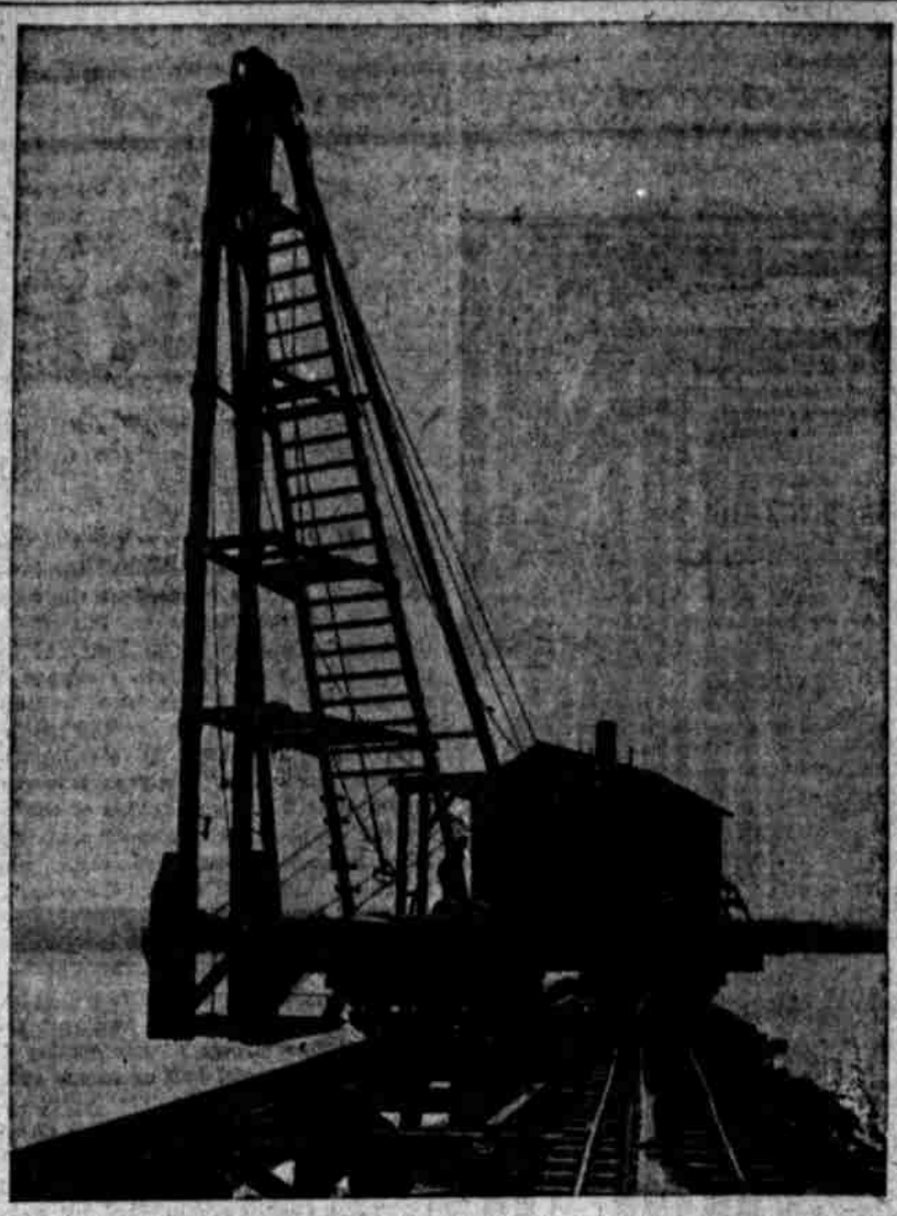
Driving Piles on the End of the Jetty.

As the channel commenced to shoal it was resolved to extend the jetty a half mile farther, delivering the