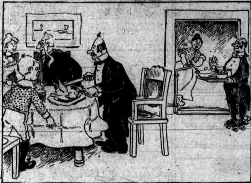
On the next trip he got stuck, and I saw there was going to be trouble.