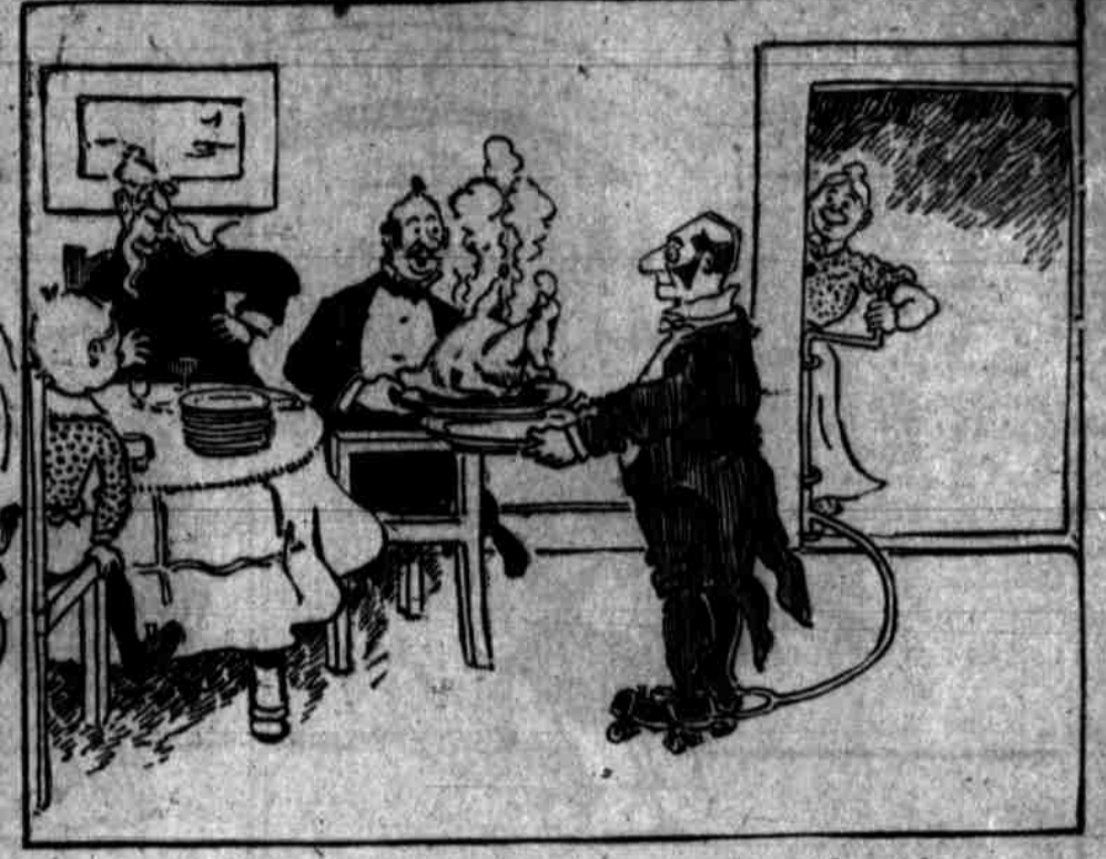
Then he brought in the turkey in fine style.