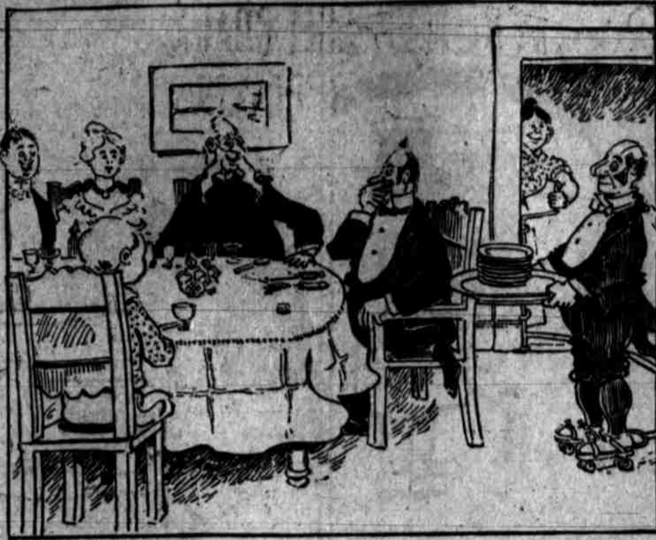
You should have seen everybody laugh when the "butler" skated in with the plates.