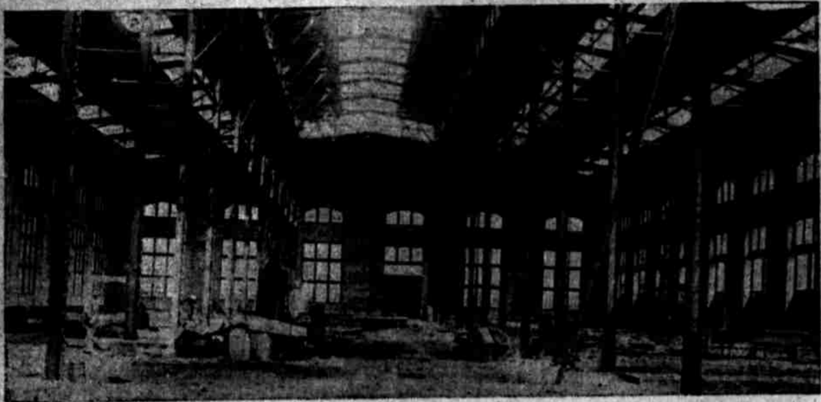
New Machineshop, Albina.

walls and steel structural material. For the present but one floor will be used, but later it is the purpose to build a gallery for the accommodation of small machines. There are 19 engine-pits in the shop, where the repair and construction work on locomotives will be done. With this number of stalls and the equipment of the shop, the company will be able to rebuild an engine in about 20 days. There will be one gigantic 120-ton electric crane in the same bay of the building where the engine pits have been built, which will be sufficient for handling the heaviest material and locomotives that will be