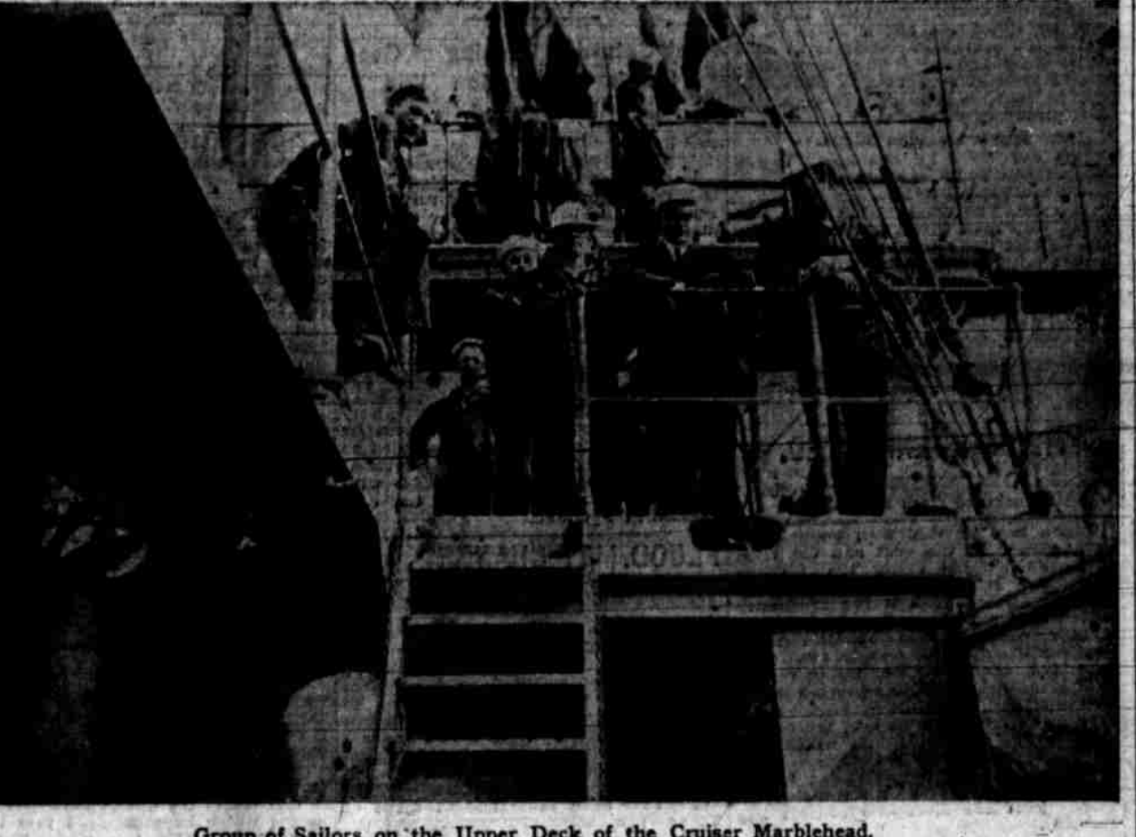
Group of Sailors on the Upper Deck of the Cruiser Marblehead.

The Marbledhead reached port yesterday afternoon at 2 o'clock, much sooner than expected by those who had been informed of the hour that she left the river from Astoria.