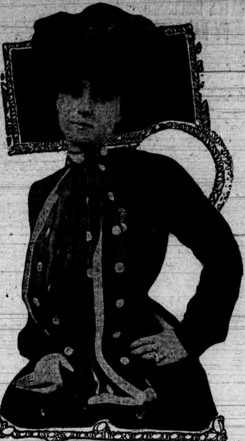
Mrs. Harry Thaw, Who Was the Beautiful Miss Nesbit, Actress and Model for the "Gibson Girl."

Looking for No. 2. "Beg pardon," said Mr. Kadley, "but isn't your last name Weeds?"