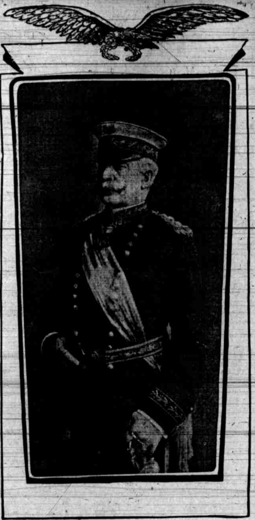
General Nelson A. J. Miles, Who Is Reported to Have Been Selected as the Next President of the Equitable Life Insurance Company.