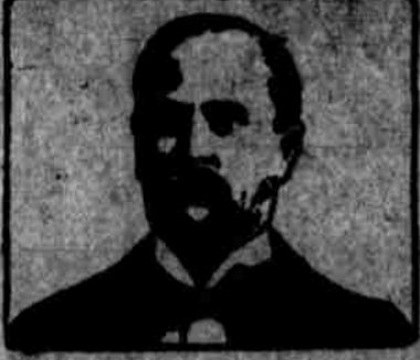
Dr. William Osler

The Different Store 39 69 - Washington St. Olds, Wetman-King