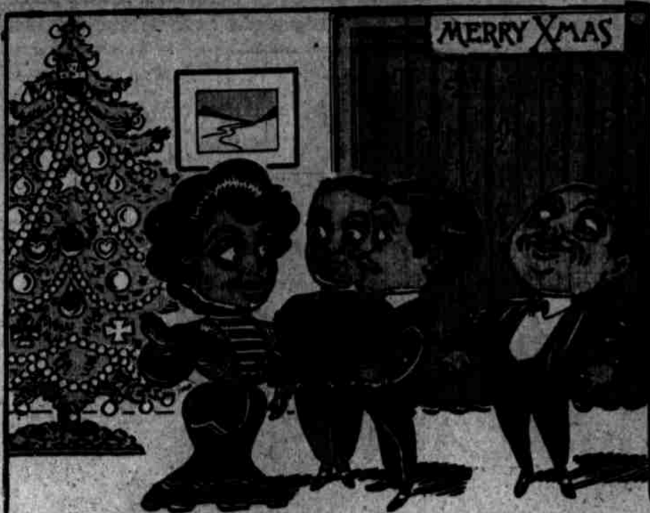
1. LULU: "Oh, Charley! Oh, Lieutenant! I am so glad to see you. Don't you think our Christmas tree looks lovely? Leander trimmed it." LEANDER (aside): "Ah, to hear such praise from those ruby lips before those butters-in."

Copyrighted, 1964, by the American-Journal-Editorial. Great Britain Rights Reserved.