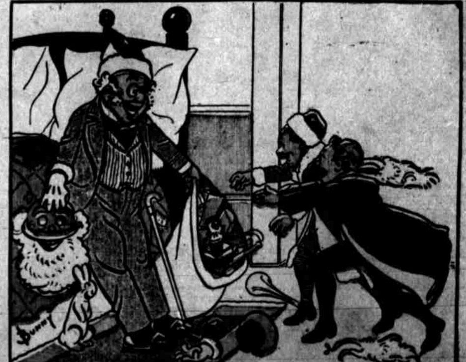
6. GRANDPA: "This is the time we have come out even. Here is your Christmas bag, boys."