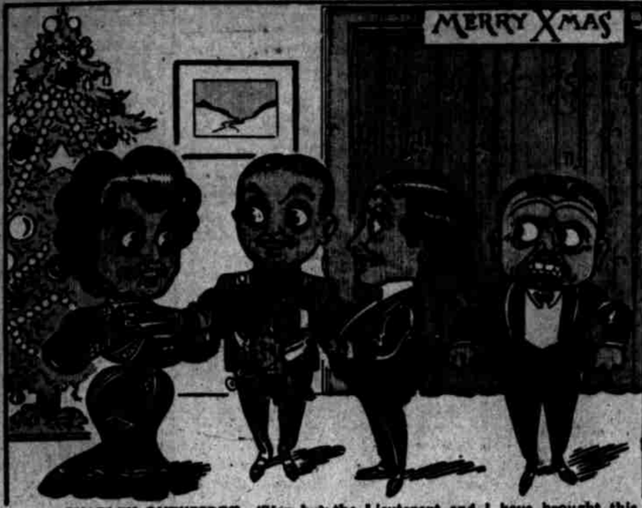
2. CHARLEY ONTHESPO: "Yes, but the Lieutenant and I have brought this beautiful swinging angel as a crowning glory to Leander's efforts. This will be what the tree really needs." LULU: "Oh, how kind and thoughtful of you. Leander, why didn't YOU think of such a lovely top-piece?"