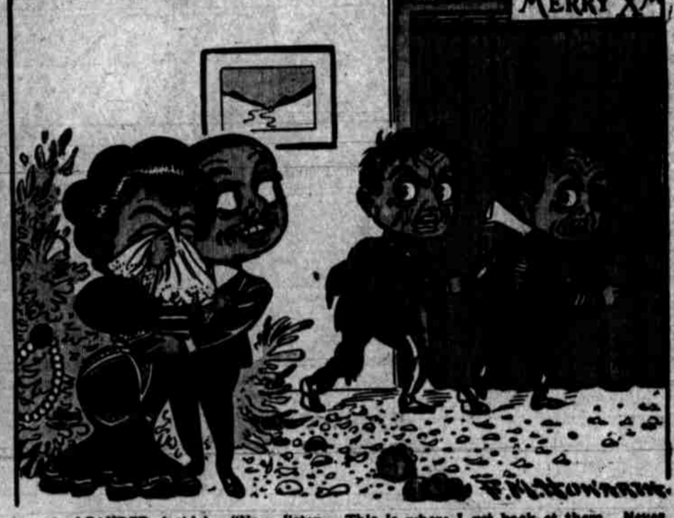
6. LEANDER (aside): "Now listen. This is where I get back at them. Never mind, Lulu, love. They have ruined your Christmas tree, but WE will have a merry Christmas for all that. Good evening, gentlemen." LULU: "Oh, Leander, it was cruel, cruel of them. They did it on purpose to ruin your beautiful work. I never wish to see either of them again."