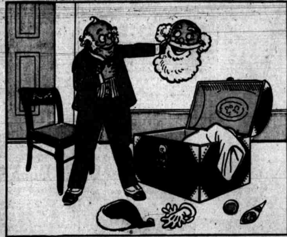
2. GRANDPA: "Well, the boys are trying to get ahead of me again. I'll put on my togs and see if I can't turn the joke on them."