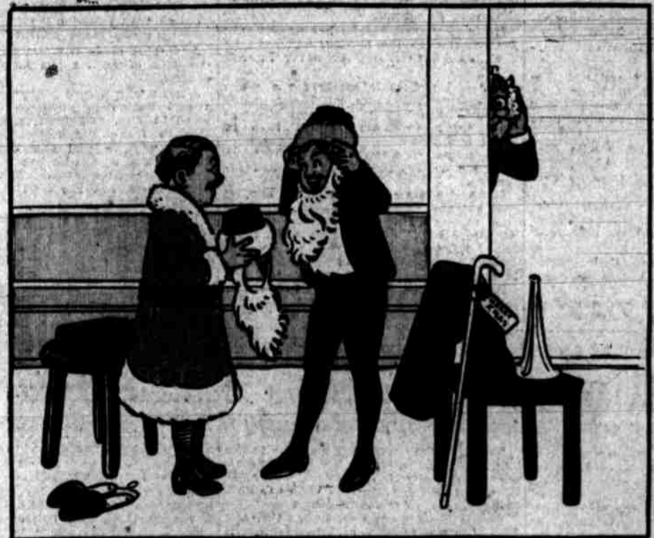
1. BOYS: "We will give Gran'pa a double surprise this time."

Copyrighted, 1964, by the American-Journal-Editorial. Great Britain Rights Reserved.