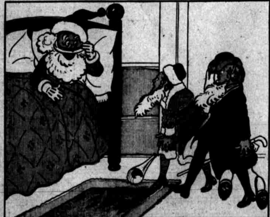
5. GRANDPA: "Why, hello! Yes, a very merry Christmas to you both"