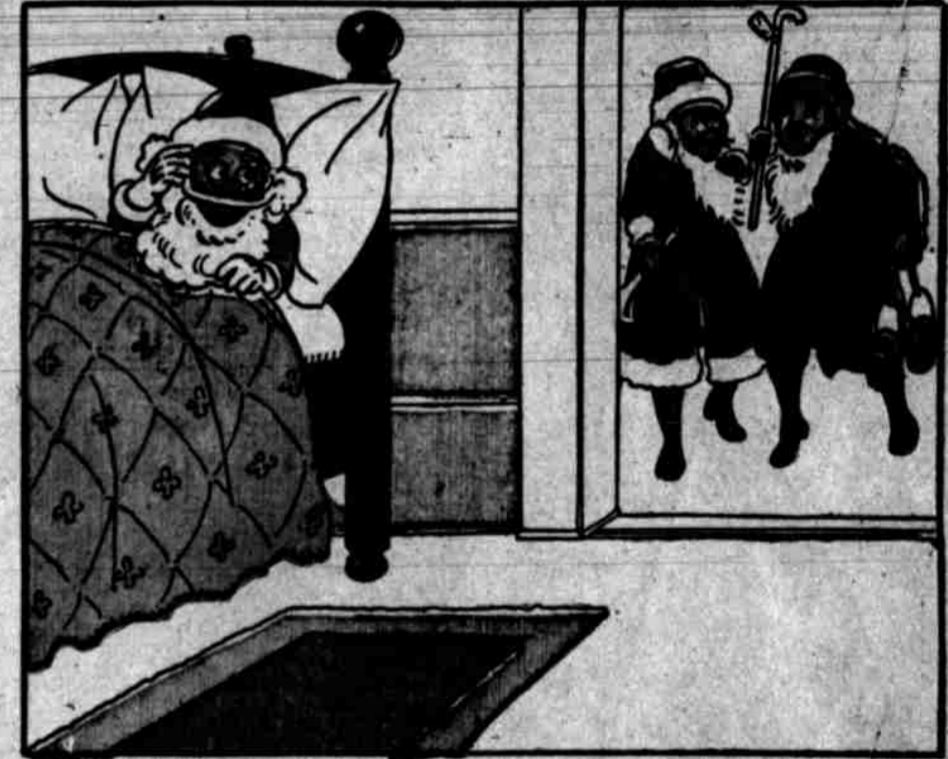
3. GRANDPA: "Ah, here they come. Under the covers for me!"