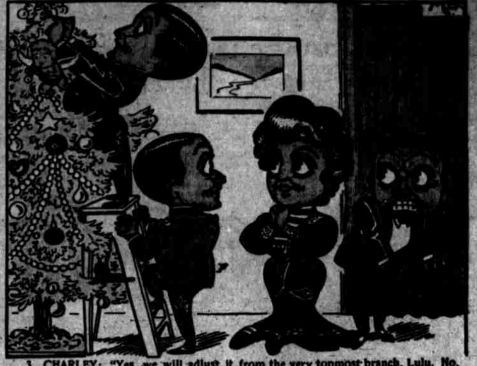
3. CHARLEY: "Yes, we will adjust it from the very topmost branch, Lulu. No, Leander better not touch it. You know he meets with so many accidents. Now, hold tight, Lieutenant, this ladder is wobbly." LULU: "Oh, how beautiful it will look. You two boys are just too dear and thoughtful for anything."