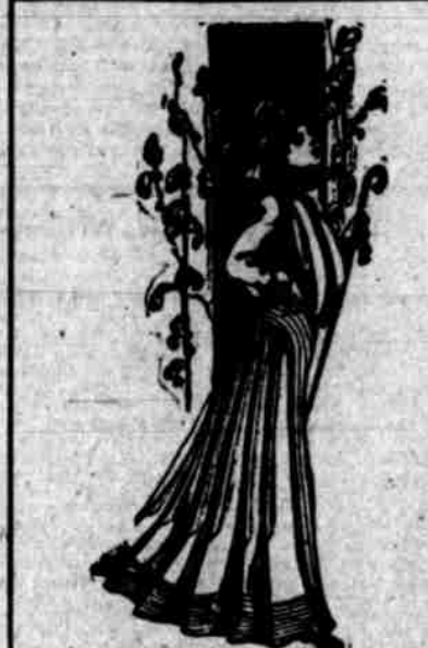
$8.50 and $10 Walking

en's white cotton winter-weight "Merode" Vests and Pants, hand fin-d, silk trimmed, softest, nicest underwear made for children-