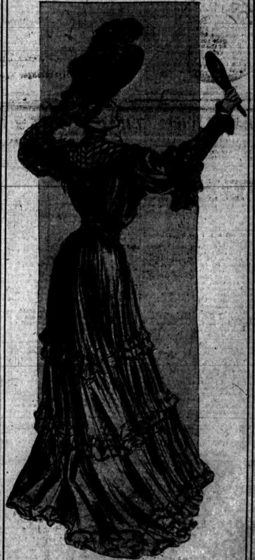
Representing the Highest Designing Art

Now ready in the great salons, second floor. 'Tis the season of the picturesque in millinery's realms. The fall and winter season of 1904-5 will go down into history as quoted above. The charming Chapeaux, with their tall crowns, broad brims, nodding plumes and sweeping aigrettes, are worthy the brush of a Rembrandt, Rubens or a Reynolds. As in gowns, the millinery of the present includes all that is quaint and beautiful in the past combined with the art of today. The period of fashion most influencing our own is that of Louis XVI. The extravagant fashions of the beautiful Marie Antoinette are reproduced in all their exquisite detail. Of course turbans will also be popular and much worn. In colors the American beauty, greens, bronzes or terra cotta, and onion shades ranging from champagne to dark, reddish browns predominate and so we might go on—for 'tis a delightful tale—but come and view the beauty show. The millinery chief and his head designer are home from New York and will hold charming at-homes for our friends all week—welcome.