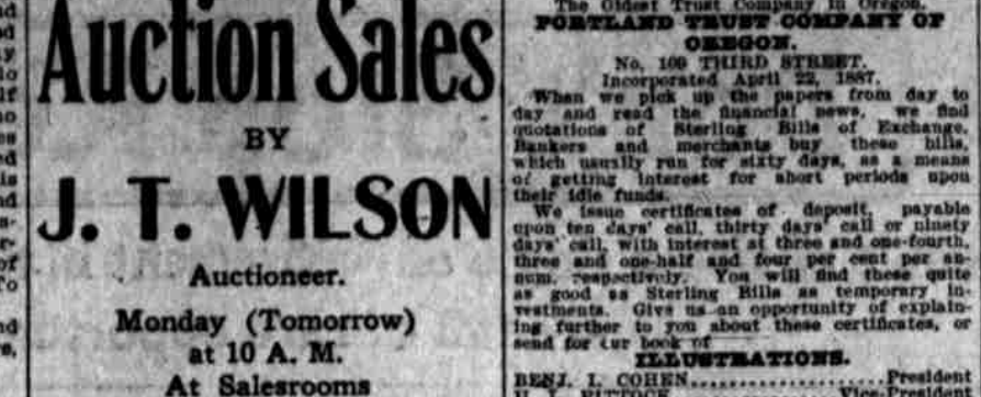
ILLUSTRATION NO. 13. The Oldest Trust Company in Oregon. FORTLAND TRUST COMPANY OF