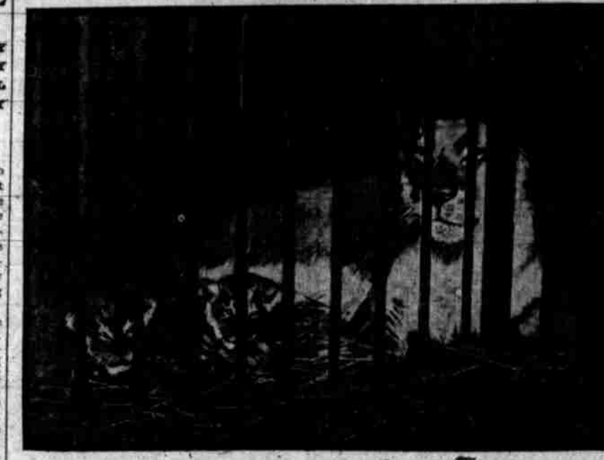
LIONESS AND HER CUBS WITH THE FLOTO SHOWS.

grared they drove the grasshoppers into the creeks, and the fish were getting all the food they wanted without assuming any risk of getting tied up in a dangerous alliance by nibbling a hook. "They kept darting up in myriads grabbing the grasshoppers as fast as they feel into the stream. I fished in one locality for six hours and never got so much as a single bite. The cattle, sheep and grasshoppers were the sole cause of my poor luck. "Over in a clear little pool by itself I noticed a dozen trout, each of which appeared to be about 18 inches long. Not being able to ensure them in any other way, I conceived what I supposed was a brilliant plan. The water looked to be about four feet deep and I concluded to go in wading and chase them out into a shallow place where I thought it would be possible to catch them. I disrobed and plunged into the water. Imagine my surprise when I went down out of sight. I kept on going down but failed to touch bottom. When