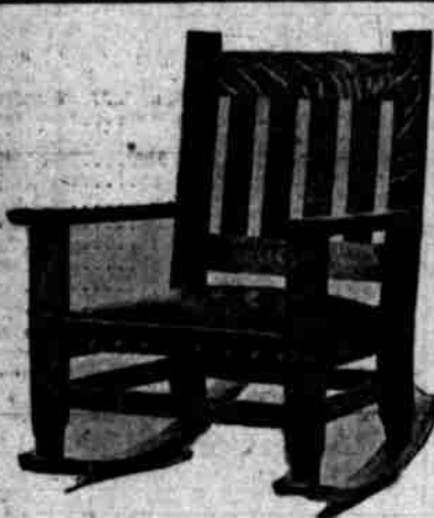
$18.00 WEATHERED OAK MIS-SION ROCKER, upholstered in genuine Spanish leather. A large, roomy rocker. Compulsory sale

Comprised of three pieces—a Settee, a large Arm Chair and a very roomy Rocker. This set is built of oak, has a beautiful wax weather finish. The seats are covered with the best grade of Spanish leather, and the con-struction of this set is first-class in every particular. Our compulsory