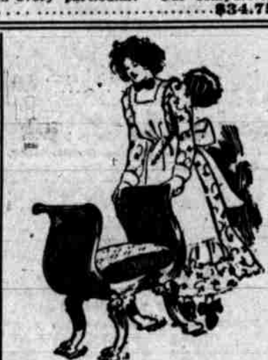
PRETTY PARLOR PIECES. We have a very large assortment of pretty Parlor Pieces which we will mark down from 20 to 30 per cent from our regular retail prices.