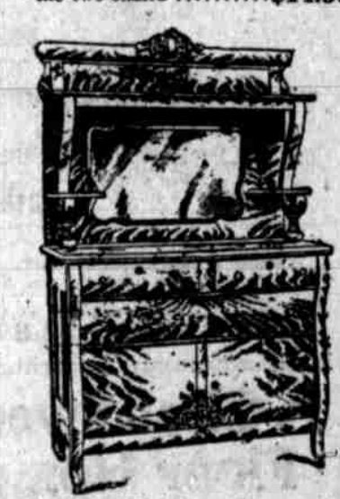
$40.00 SIDEBOARD. A big massive piece of furniture, beautifully carved, richly finished in gold and superbly hand-polished. The top of the base is 24 inches in depth and 4 feet in width, and the French bevel mirror in the back measures 16x28 inches. Compulsory sale price......$26.00