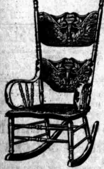
LARGE, ROOMY ROCKER, substantially built and finished in the dark golden oak. This is an extraordinary value. Compulsory