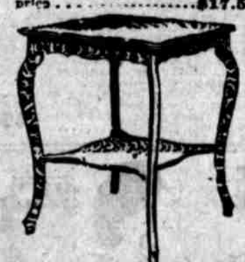
14.00 CENTER TABLE. This table is in two finishes—golden oak or imitation mahanny 24x°4 inch top, solidly fastened. Shapely legs, rigidly braced by subscantial shelf. Compulsory sale price