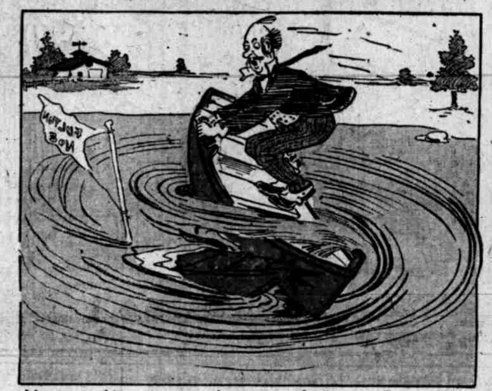
I knew something was wrong when we started going around in a circle. so I.came up.