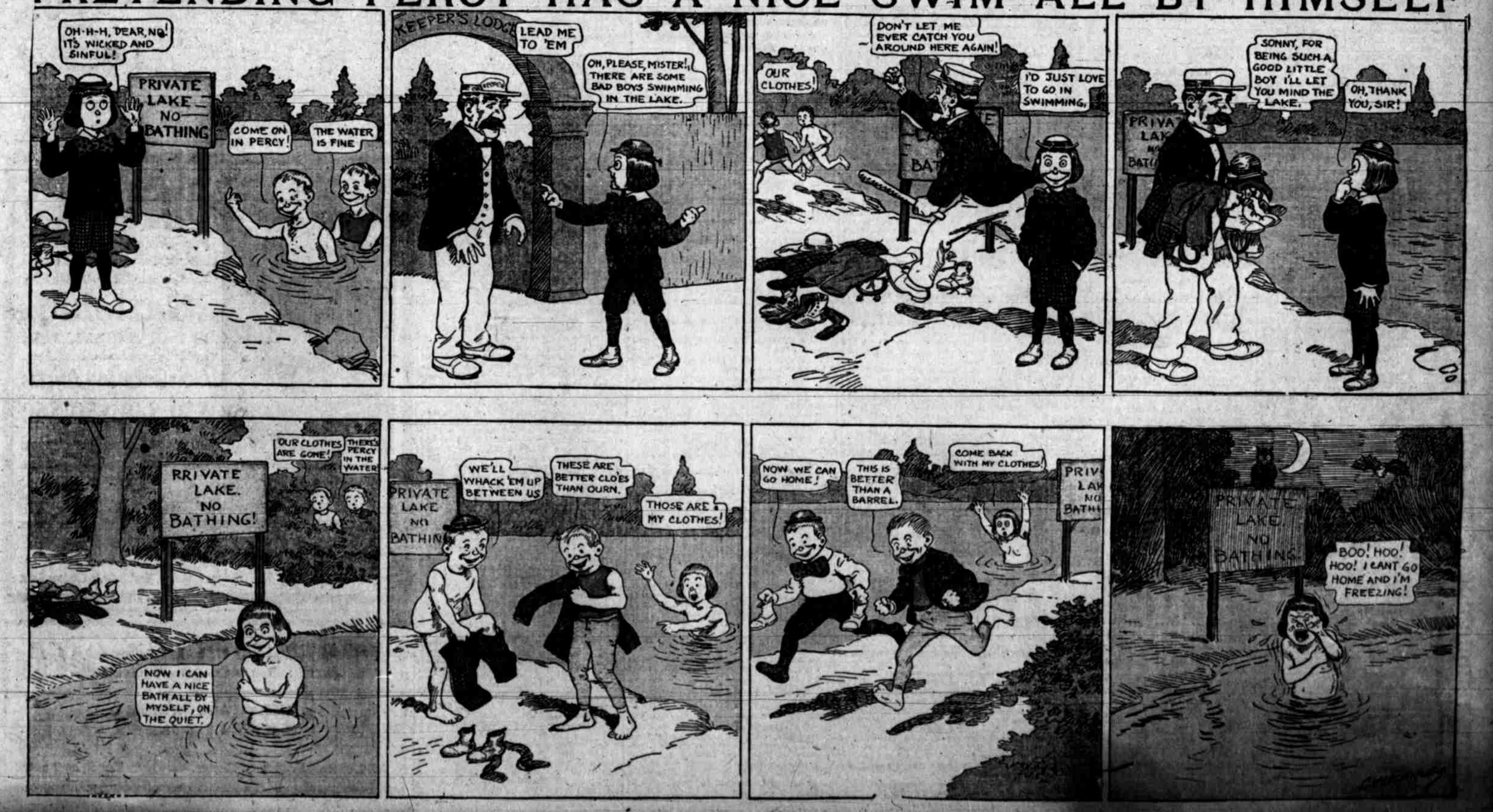
PRETENDING PERCY HAS A NICE SWIM ALL BY HIMSELF