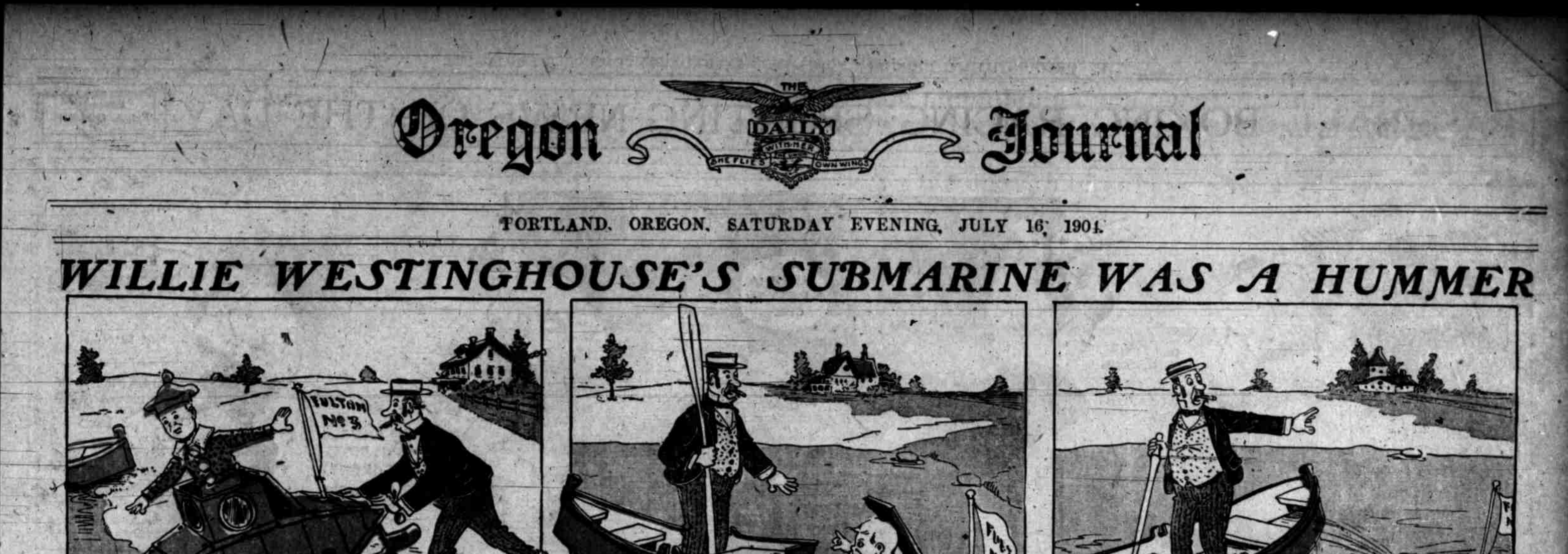
Dear Tommy-I've just built another submarine boat. Papa helped me launch it-