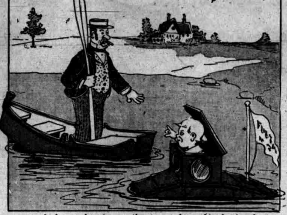
And went along in a row-boat to see that nothing happened.