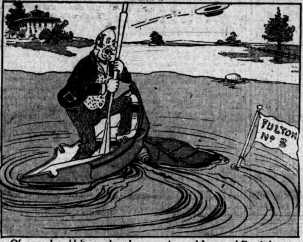
Of course I couldn't see where I was steering, and I rammed Papa's boat. .