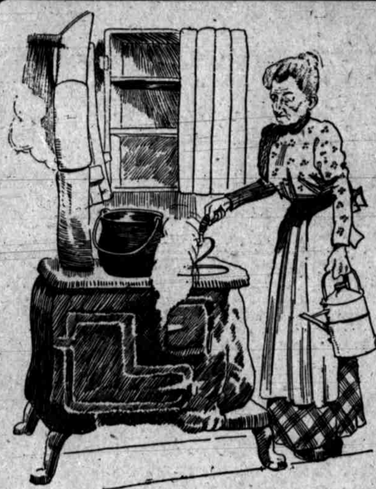
THE OLD WAY—YEARS AGO. (COULDN'T KEEP HERSELF)