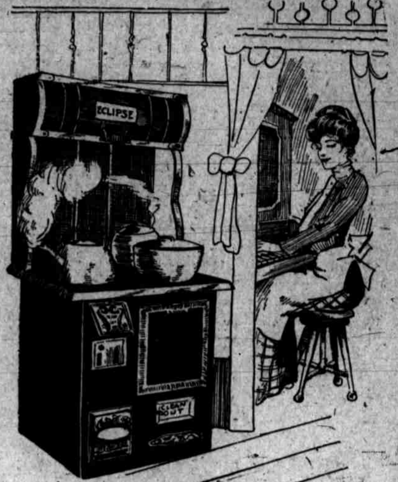
THE NEW WAY—TODAY. (GIVERTS HELPS HER NOW)