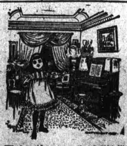
What rapid progress that bright little daughter will make if you take advantage of this sale.