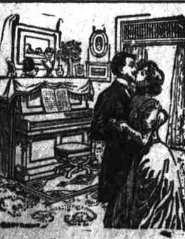
How music cheers the evening hour. Why not talk it over with "hubby" tonight.