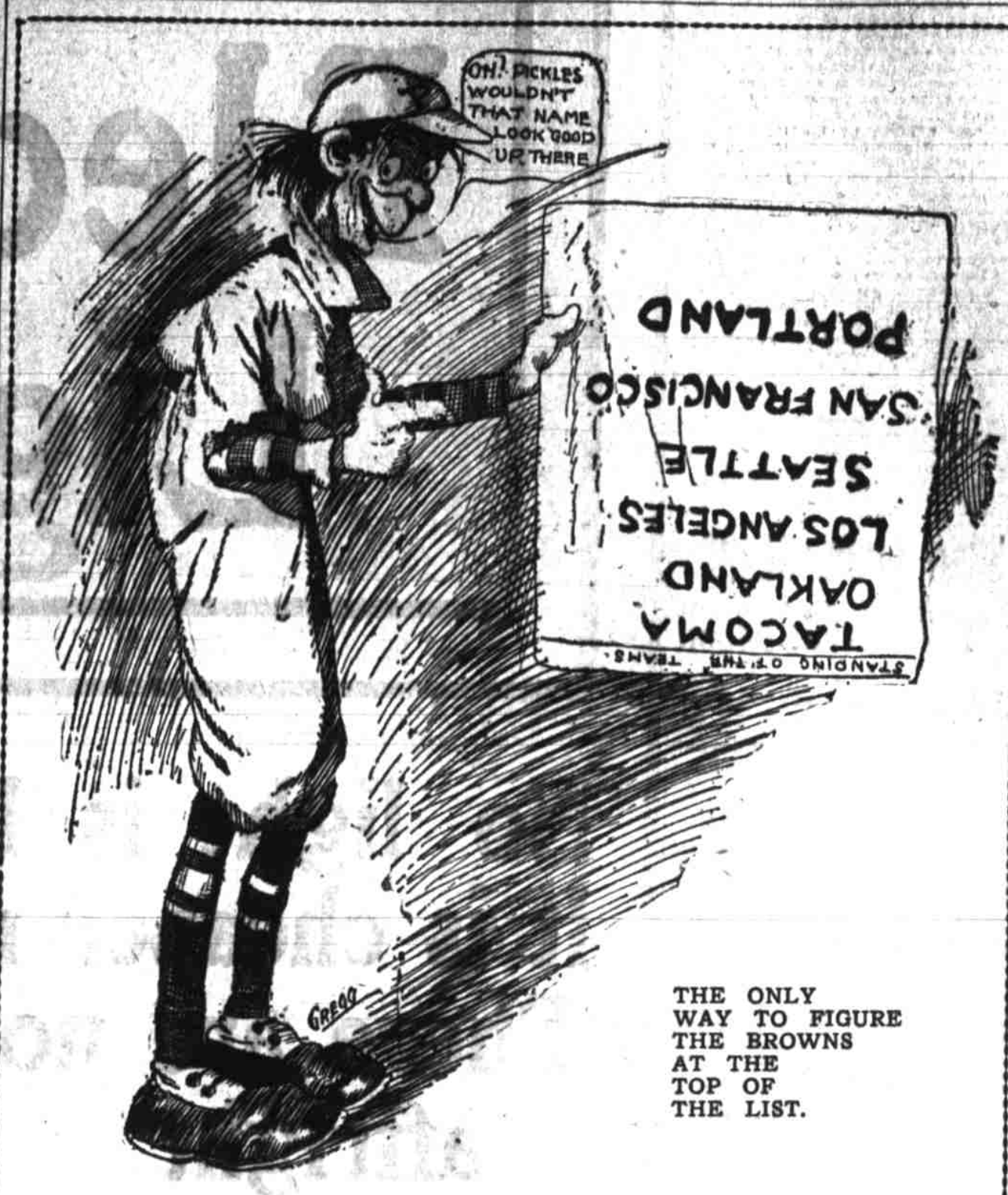
THE ONLY WAY TO FIGURE THE BROWNS AT THE TOP OF THE LIST.