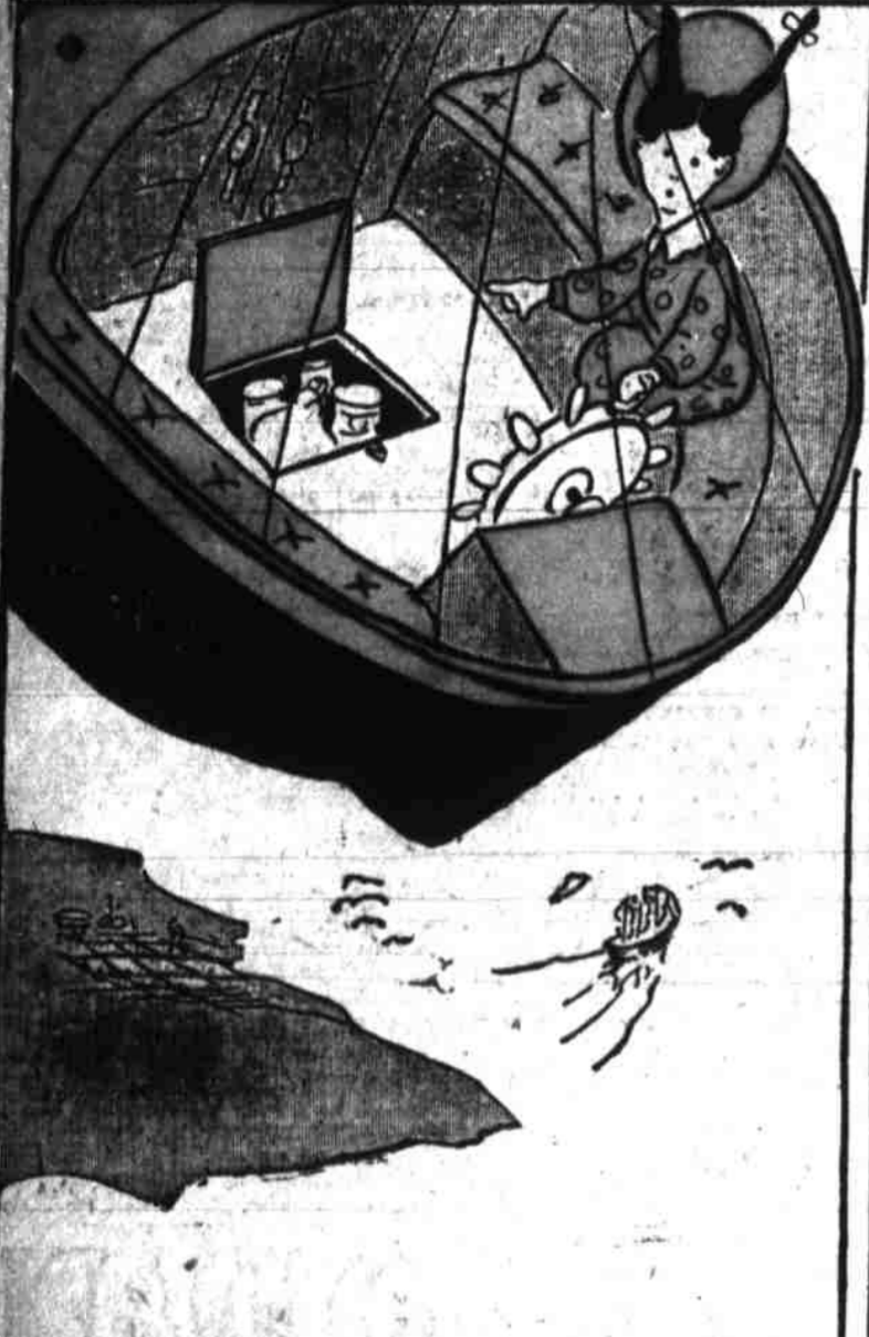
1—I HAD BEEN SO busy catching sea-serpents and fighting dragons that I forgot all about keeping my water tanks and food lockers full. Now I discovered they were almost empty, and I had to stop at the very first land sighted and get more.