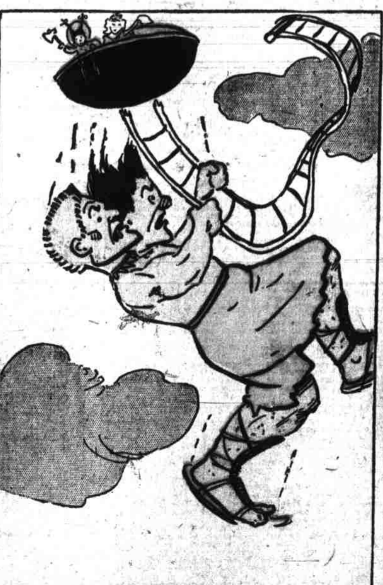
11—THEN I THOUGHT OF the hatchet in the tool chest, and snatched it out. Whack! Whack! Whack! There was a loud shriek like a locomotive whistling as it passes you, and the Giant turned a million somersaults into space.