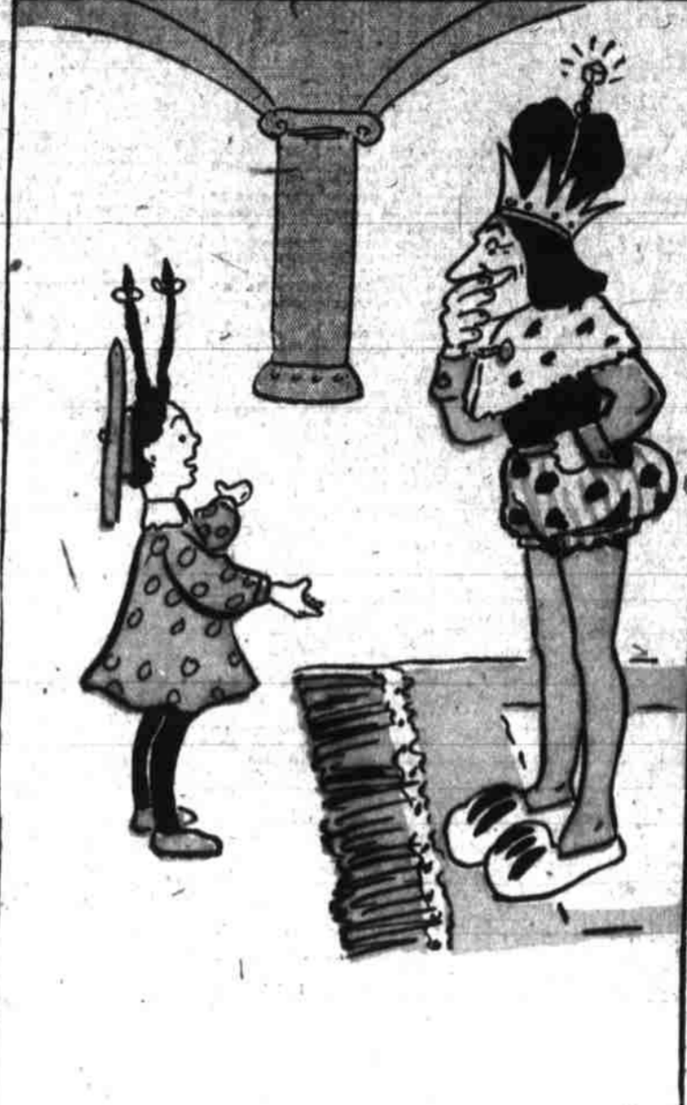
3—HE TOLD ME HIS daughter, the Princess, had been spirited away from the castle, and was held prisoner by a Ferocious Two-headed Giant they called Twoface. Phoo-ew! That looked rather serious, but I was in for it.