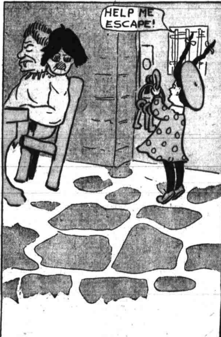
7—THEN I NOTICED A bunch of keys at the Giant's feet, and quickly tried them in the lock. At last the door swung open and out flew the Beautiful Princess. The Giant moved about uneasily, and as we ran out the door he gave a terrible roar and started after us.