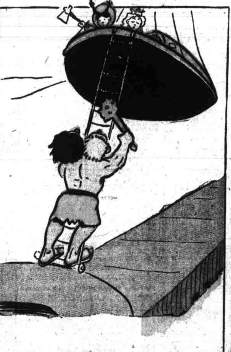
10—BUT WHEN I DID! Oh, I thought we were lost sure, for the Giant was climbing up the rope ladder! I sailed up and down, back and forth and sideways, but I couldn't shake the villain off.