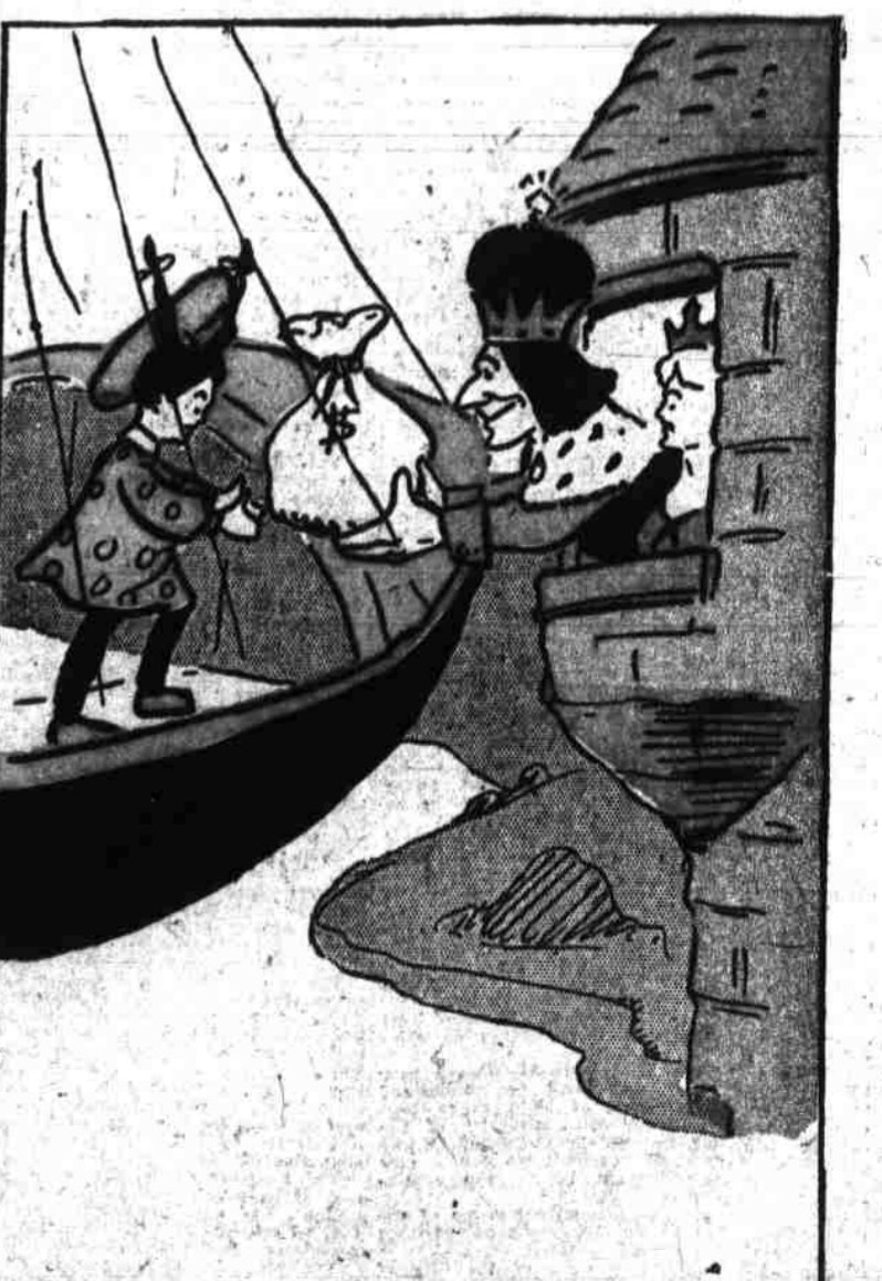
12—WELL, THAT WAS ABOUT all for that Giant, I guess! We sailed back to the King's Palace, and you never heard tell of such a joicing and feasting as followed the announcement that the Princess had been rescued. After it was all over the King piled a lot of gold in my ship and I sailed away.