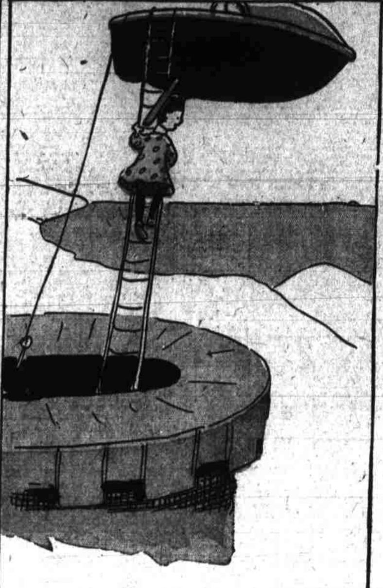
4—After getting something to eat, I sailed away for the Giant's Castle, which stood on a high mountain on the horizon. In a jiffy I was anchored to the castle, and scampered down the ladder and into the stone windows of the great building.