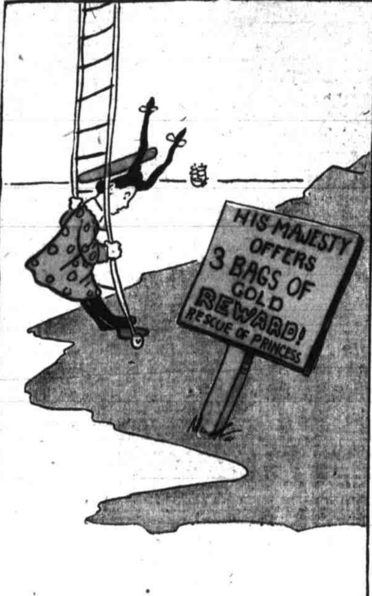
2—I CAME DOWN on a strange coast, where the first thing I saw was a sign telling of a big reward. Well, getting rewards seemed to be right in my line, so I thought I'd step around to the King's Palace and offer my services.