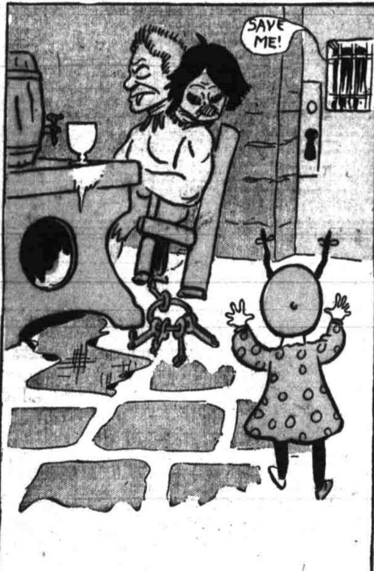
6—I PULLED THE great door open and heard a moaning voice, which came from a dungeon cell opposite. Of course, I supposed it was the Princess. I ran to the door, which was locked securely.