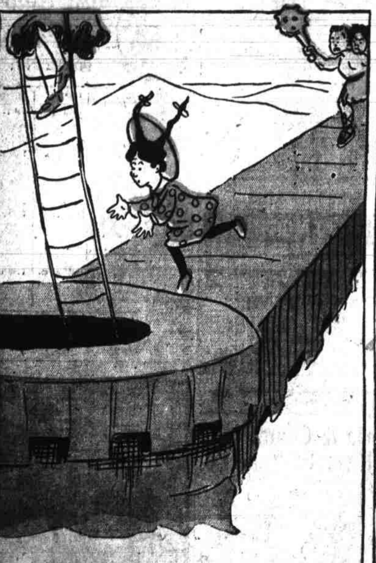
9—THE PRINCESS CLIMBED the ladder and I scrambled up after her like a streak. I turned on the power, and the good old airship shot up into the air. Not till then did I dare look down.