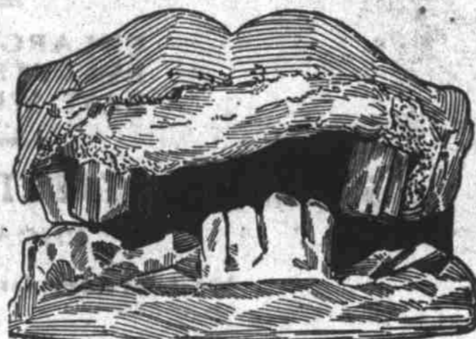
This illustration shows a cast of a lady's mouth before it was placed in order by our painless method of putting in teeth without plates. Opposite this shows how we can improve the looks of the mouth.