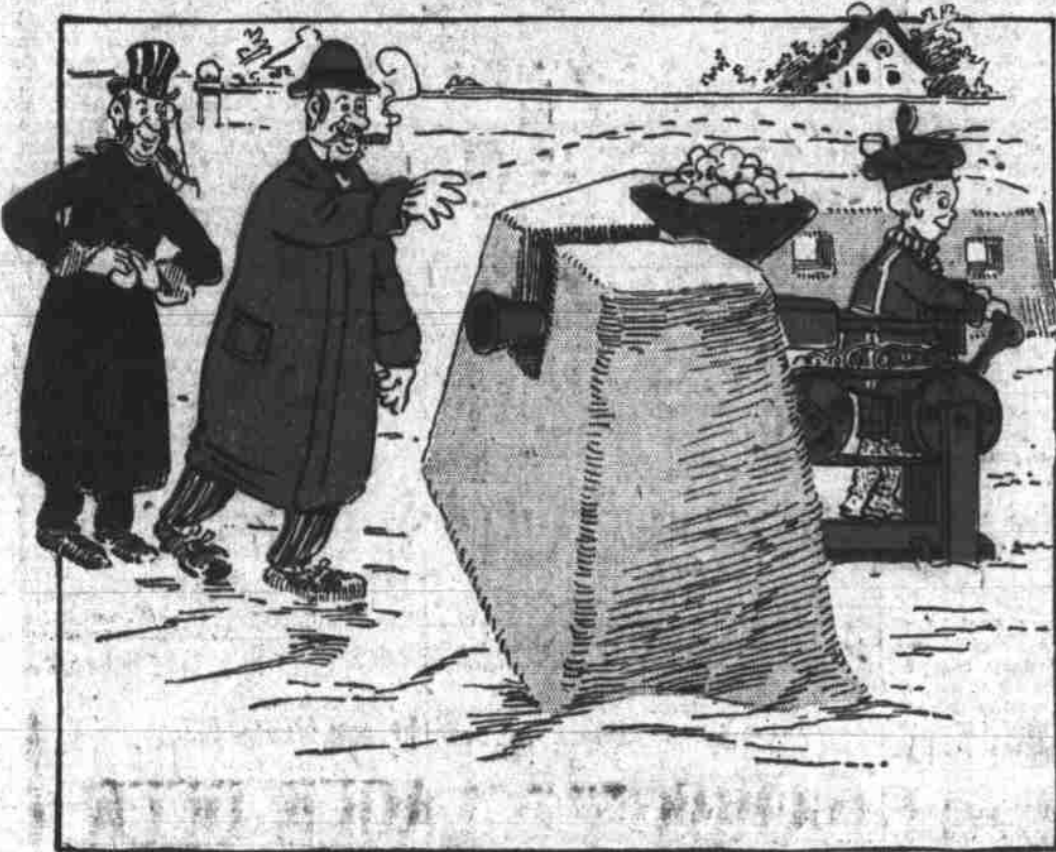
And turned it on at the first sign of trouble.