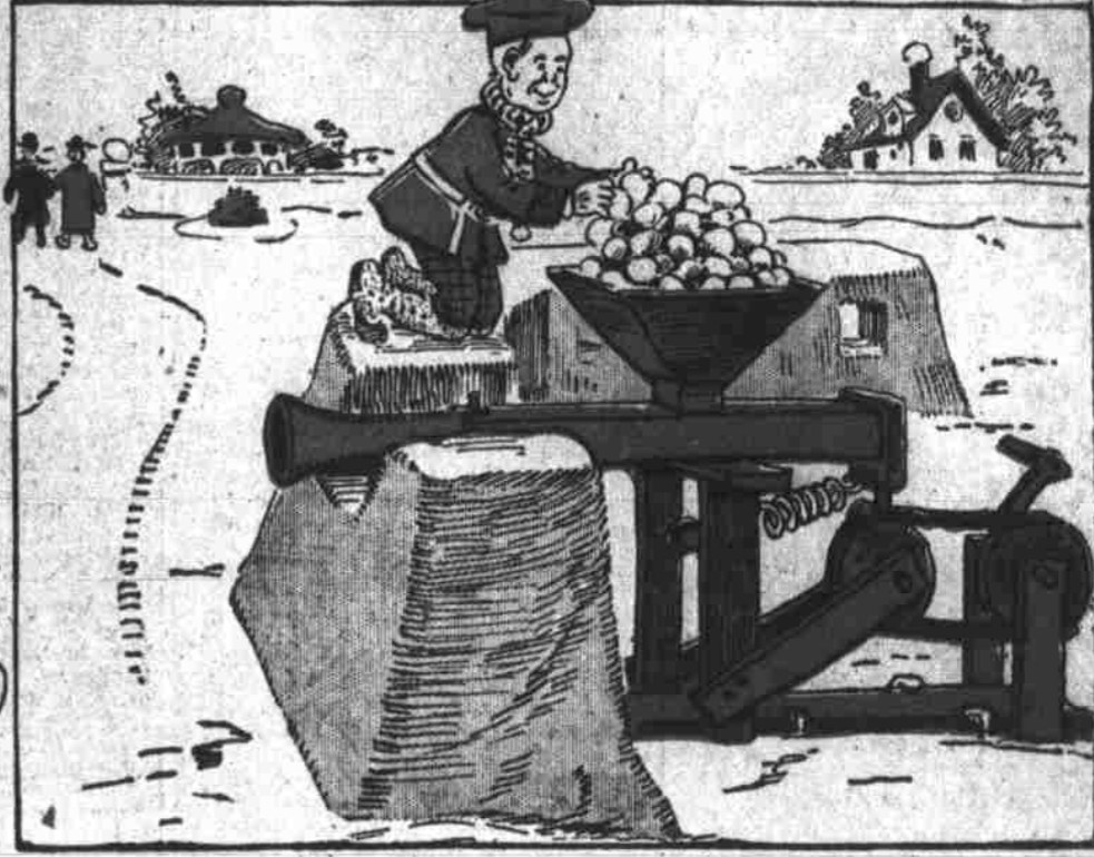
Then he invented a snowball Gatling—