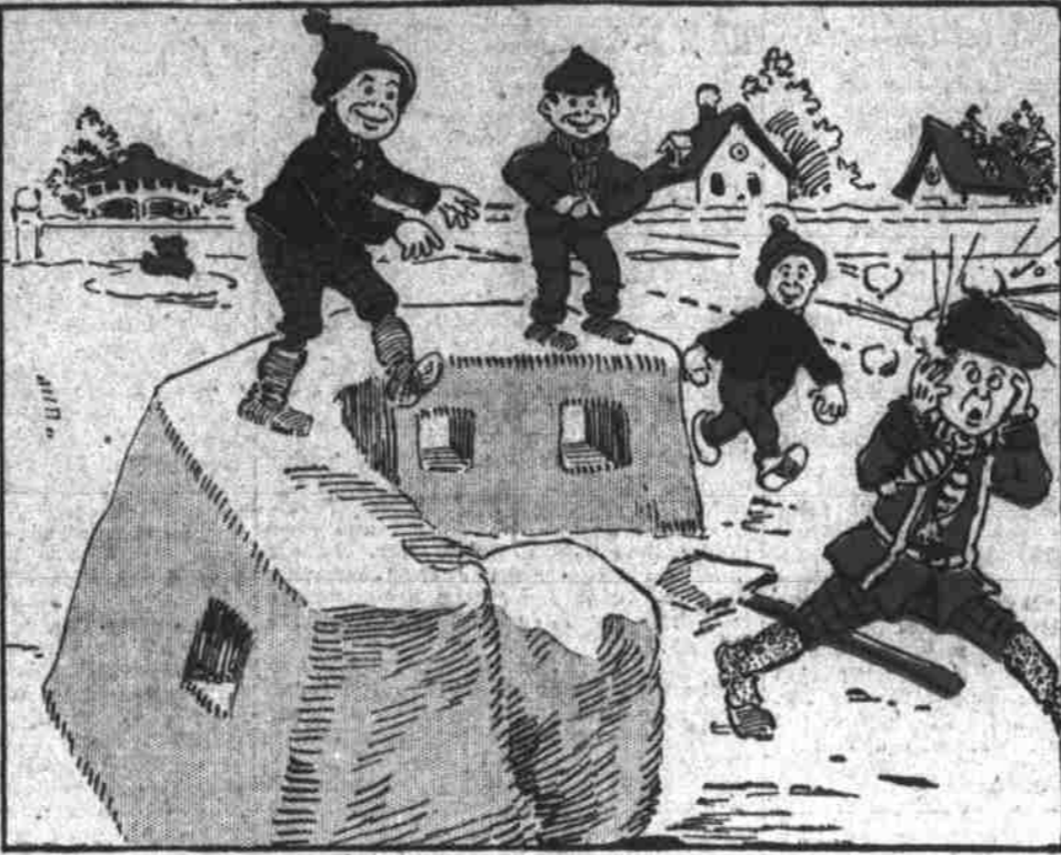
And drove him away from his position.