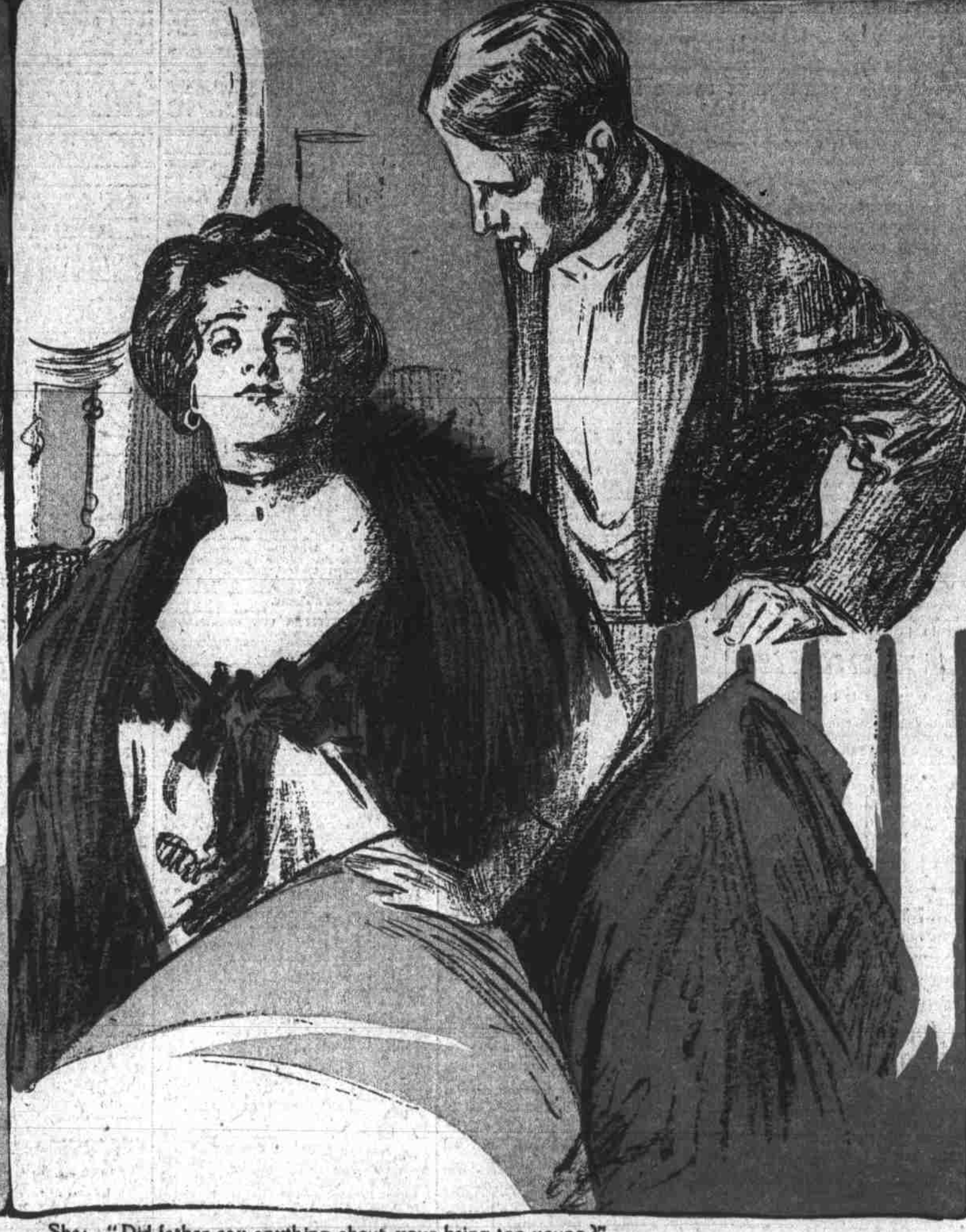
She: "Did father say anything about your being too young?" He: "Well, yes; but he said I'd age pretty rapidly after we were married, and I had to pay your bills."