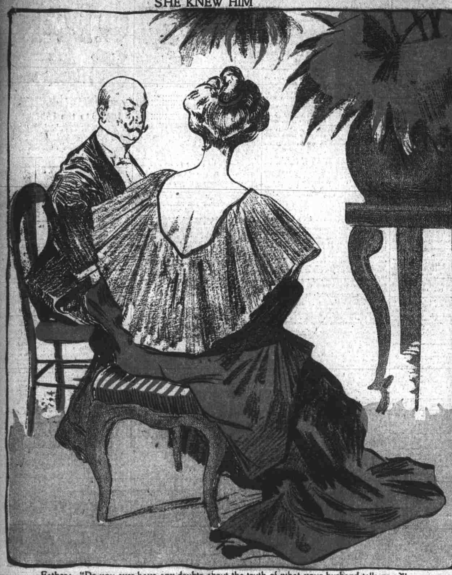
Father: "Do you ever have any doubts about the truth of what your husband tells you?" Daughter: "Never! I know he couldn't tell the truth if he tried!"