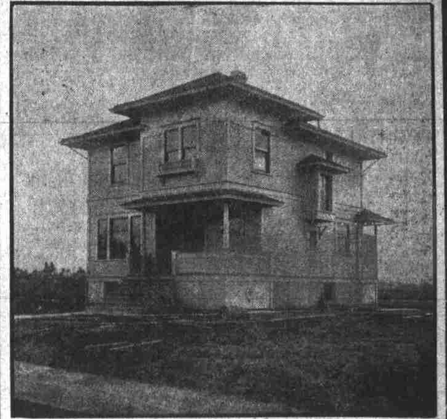
HOUSE BUILT BY US ON MONTHLY INSTALLMENTS.

It's a pleasure to us to show you this property. You will appreciate it on sight and if you don't buy you'll miss the opportunity of a lifetime, which only comes to mankind once in life. There is one thing about this proposition that the public don't understand—a year ago you could get a house and lot on similar terms in the Hawthorne Addition—now you cannot. It will be the same in Ladd's Addition in less than a year from this date. Act at once.