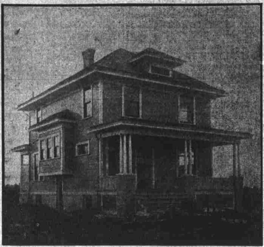
YOU CAN OWN A HOME LIKE THIS IF YOU WANT TO.

No matter your capital or your monthly income, any man able to meet monthly rent bills can buy a lot and build a home on our easy payment plan, which is certainly one that home seekers of limited capital should appreciate.