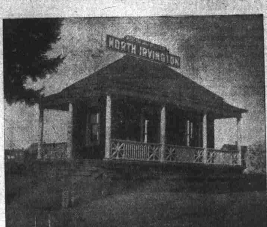
Our North Irvington office is on the corner of Union avenue and Failing street, agent in attendance daily from 2 to 5 p. m., or call at headquarters for maps, plans and full information.

Real estate in Portland is cheaper than in any other city of like importance in the United States. There is no other growing and important city where you can buy a fine residence lot, 50x100 feet, for $300 or $400, as close in to the center of the city as you can in Portland, Or. This condition of things will not last long. Real estate values in Portland are bound to advance; we look for a great rise next year. The wise ones are buying NOW.