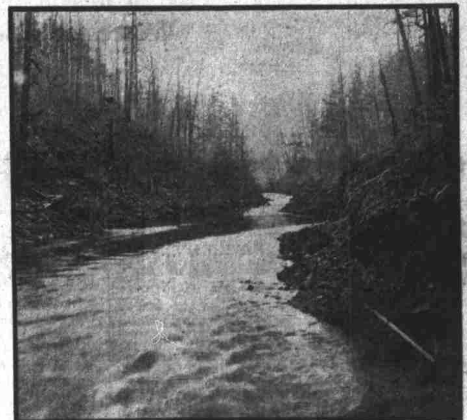
CLACKAMAS RIVER CURVE, ESTACADA.

There are 2,000,000 immigrants coming to the United States annually. Oregon's increase in population will be stupendous in the coming years. A town with the opportunities of Estacada will be the center of an immense population. It will be the seat of amazing progress. Can any reader of The Journal afford to miss this opportunity to get into a proposition of this kind while he may do so on the ground floor