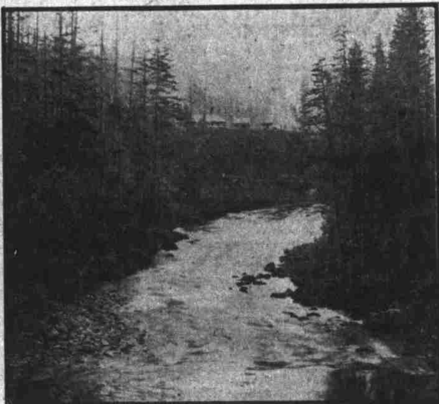
CLACKAMAS RIVER RAPIDS, ESTACADA.

Which the townsite company will erect at once. This house will be equipped with every modern convenience. It will have water upstairs and down, upstairs and downstairs dining rooms, electric call bells, patent toilets up and down stairs, large parlors, broad hallways, and all other things that appertain to the very latest hotel accommodations. The hundreds of tourists that will visit Estacada in pursuit of pleasure on its adjacent hunting grounds or angling for mountain trout in its laughing river, will want all the accommodations to which they have been accustomed at their homes. They shall have them.