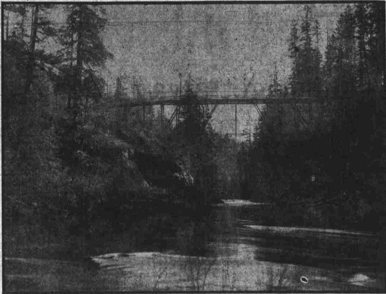
CLACKAMAS RIVER BRIDGE, ESTACADA.

TOWNSITE COMPANY'S OFFICE, ROOM 5, OREGON WATER POWER & RAILWAY COMPANY'S BUILDING, FIRST AND ALDER STREETS, PORTLAND, OREGON.