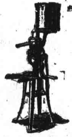
Simplex Cream Separator.