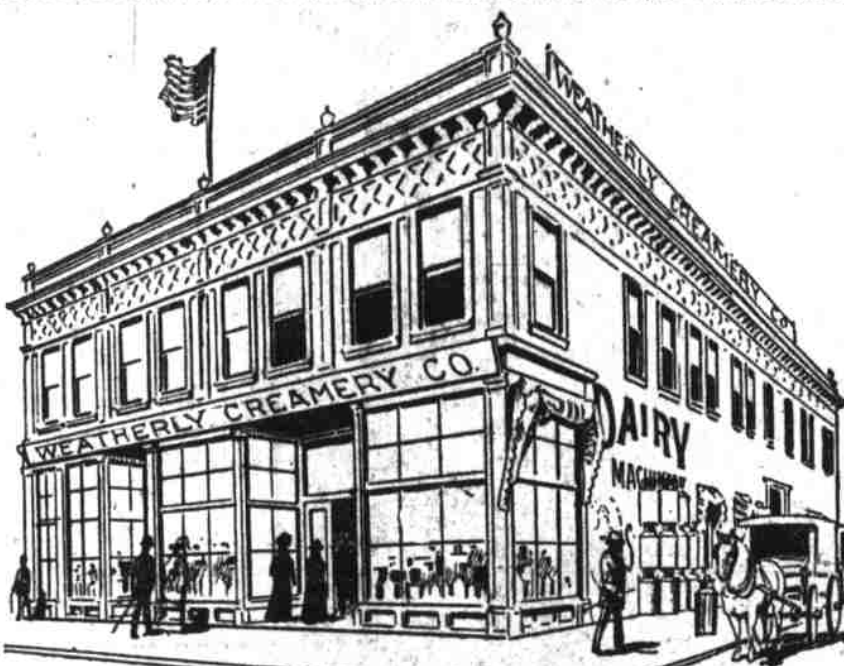
WEATHERLY CREAMERY COMPANY