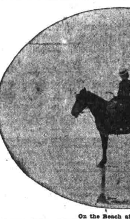
On the Beach at Low Falls.