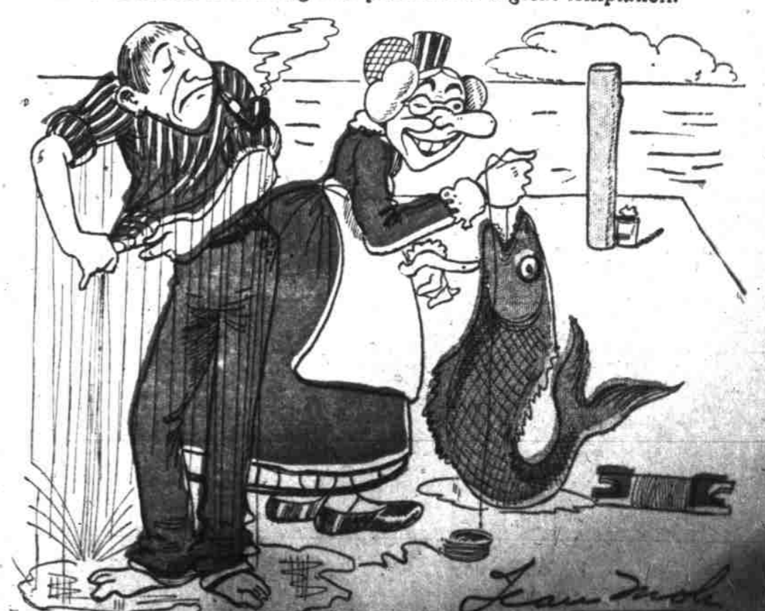
Notwithstanding the catch, Obadiah seems dismal. Wonder why?