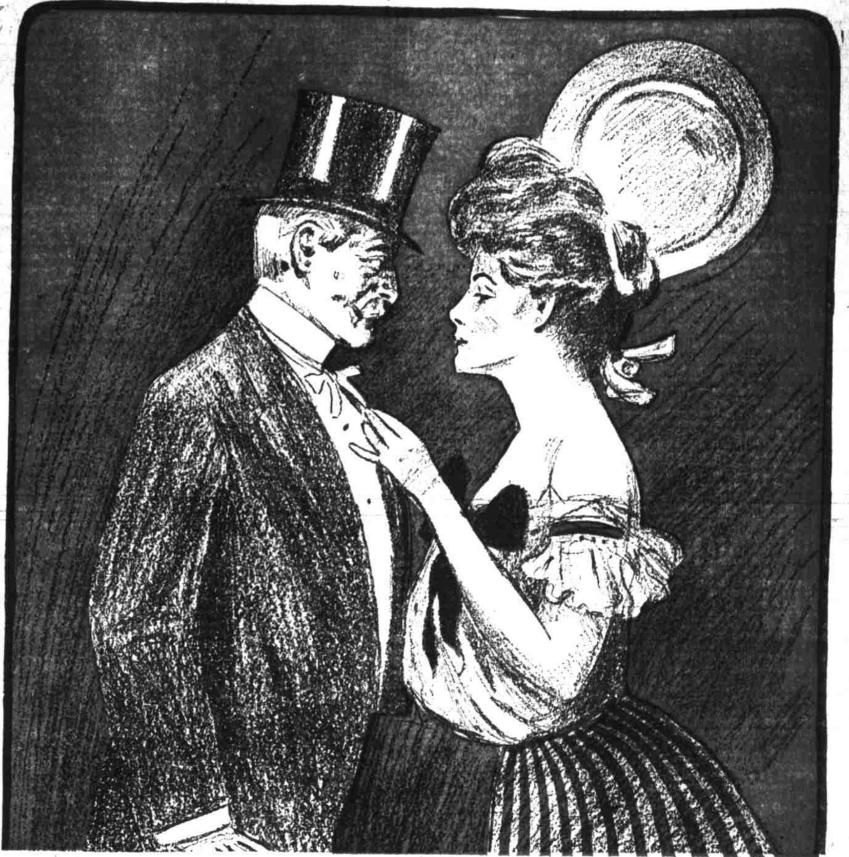
Mabel—"Let me tie your necktie for you, daddy." Daddy (wise from experience)—"All right, my dear; but what is it this time—a new hat or an automobile?"