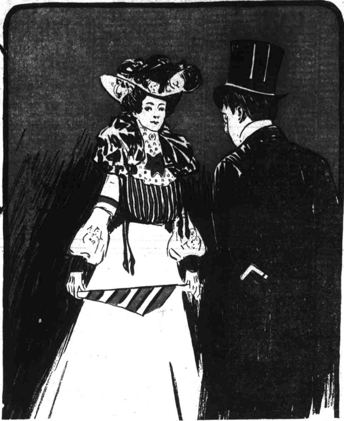
"I don't think she's a particularly economical wife." "You don't? If a woman who saves her wedding dress for a possible second marriage isn't economical, I'd like to know who is!"