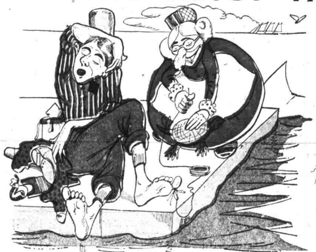
Lazy Obadiah combining two pleasures is a great temptation.