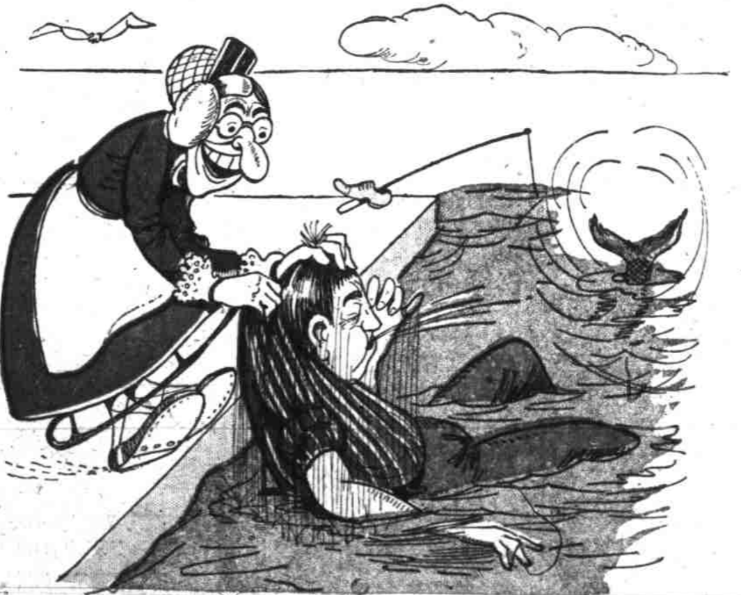
She eventually comes to the rescue and lands both Obadiah and the fish.