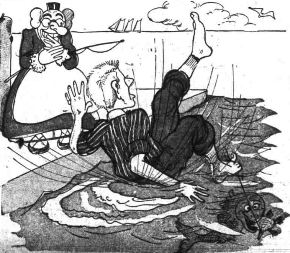
And Auntie, succumbing, meets with great success.