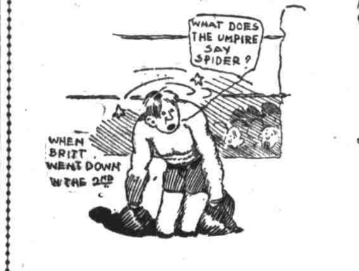
WHEN BRITTS WENT DOWN WITH THE DOP