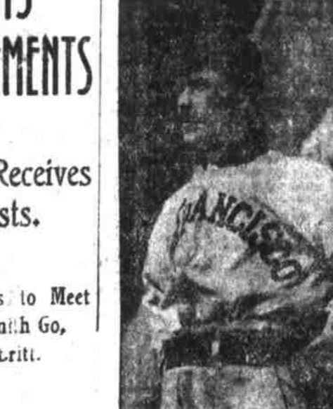
Capable Center Fielder of the San Francisco Team.