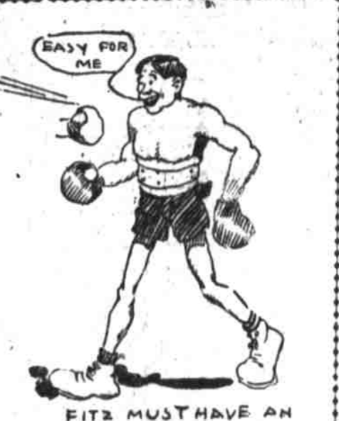
FITZ MUST HAVE AN IRON GLAD BODY.