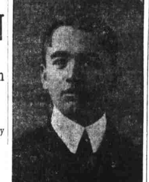
First Baseman and Captain of the Browns, Whose batting and Fielding could be improved.