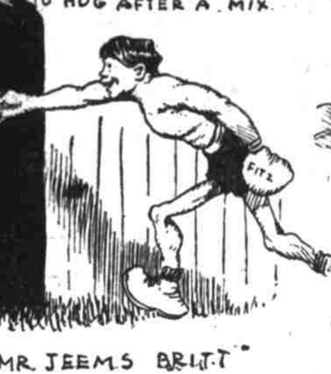
AND AFTER THE FIGHT JAMES LECTURED A BIT ON THE 'COOL DOME OR THOUGHT