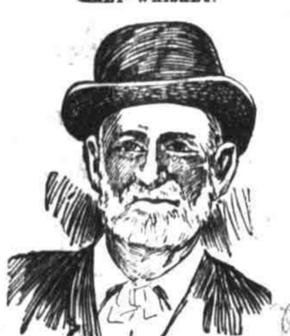
As Well as 40 Years Ago.

Strong, Healthy and Full of Vigor, Thanks to DUFFY'S PURE MALT WHISKEY.