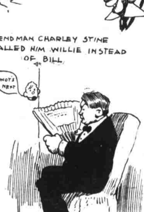
READING HIS PART FROM THE BACK OF THE FAN.