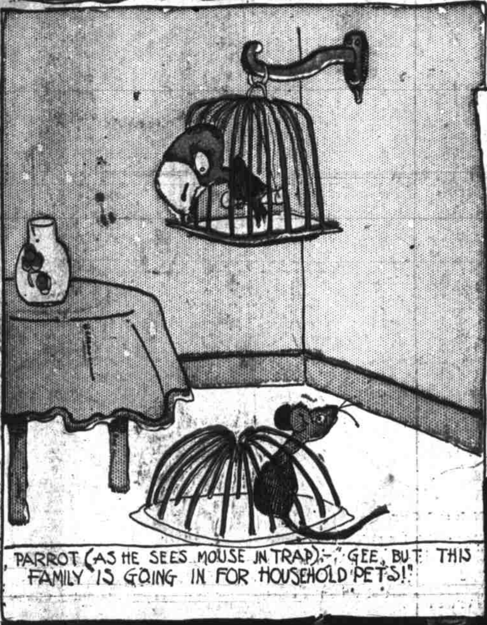
PARROT (AS HE SEES MOUSE IN TRAP):- "GEE, BUT THIS FAMILY IS GOING IN FOR HOUSEHOLD PETS!"