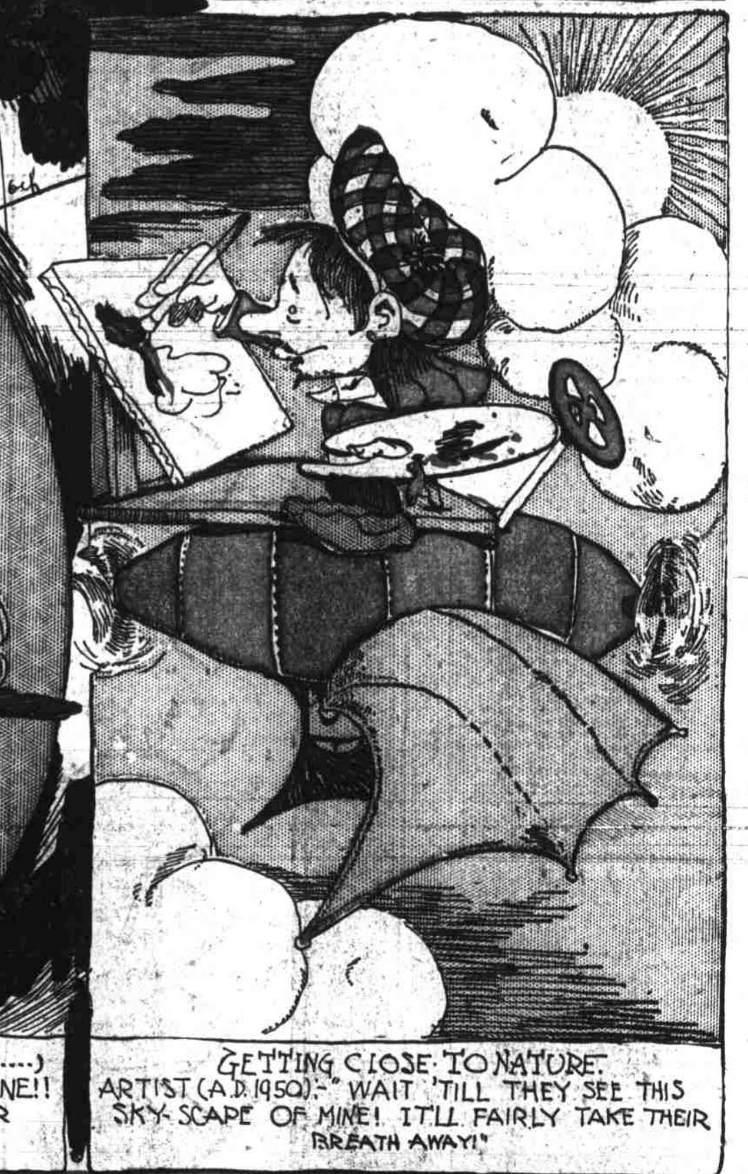
GETTING CLOSE TO NATURE. ARTIST (A.D. 1950):- "WAIT 'TILL THEY SEE THIS SKY-SCAPE OF MINE! IT'LL FAIRLY TAKE THEIR BREATH AWAY!"

THE INEBRIATE:- (HIC!)..... PROMISHED (HIC.....) M'WIFESH ZHAT I'D WALK (H-H-HIC) CHALK-LINE!! (HIC-HIC!) ZASH CROOKEDSH CHALK-LINE I EVER (HIC-ITY-HIC!) SAW! (HIC-HIC-HIC)!!!!