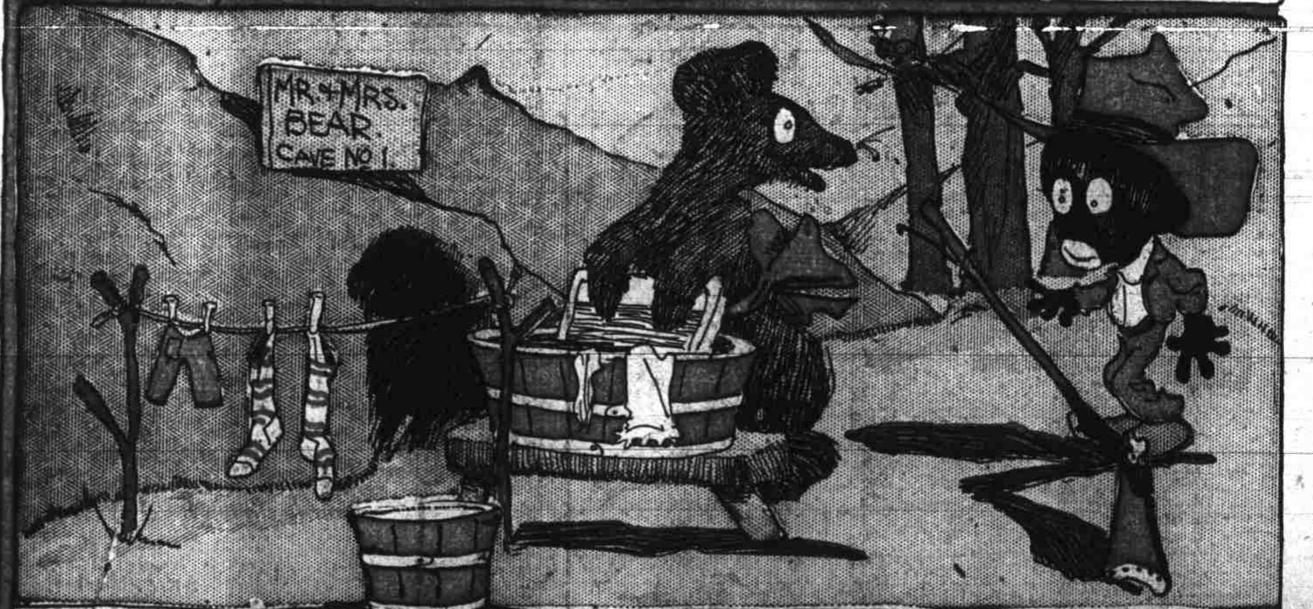
MRS BRUIN:- "WHY HERE'S LITTLE GEORGE WASHINGTON SNOWBALL! IF I'D HAVE KNOWN COMPANY WAS COMING, I'D HAVE TIDIED UP A BIT!"