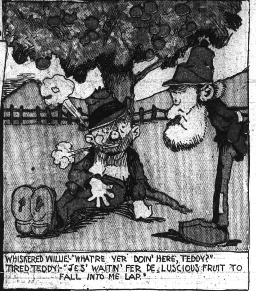
WHISKERED WILLIE:- "WHATRE YER DOIN' HERE, TEDDY?" TIRED TEDDY:- "JES' WAITIN' FER DE LUSCIOUS FRUIT TO FALL INTO ME LAP."