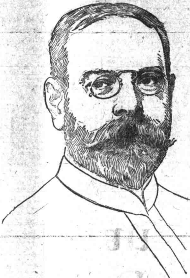
Leader of the Celebrated Concert Band.