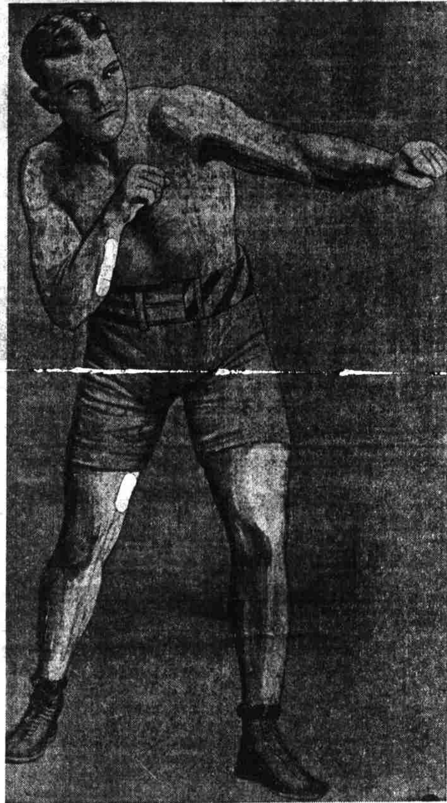
JAMES JEFFRIES Champion Heavyweight Pugilist of the World.

weight pugilist, and it is just possible that the respite of two years since he did any fighting has benefited rather than injured him. While shrewd bettors natu-