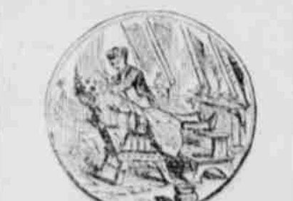
THE FIRST CLASS BATH, SHAVE, SHAMPOO OR HAIR CUT IN THE LATEST STYLE.