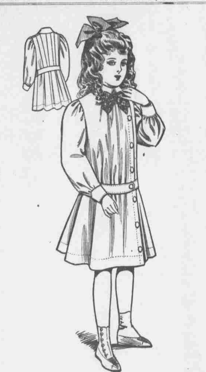
2583 GIRLS' AND CHILD'S RUSSIAN DRESS. Paris Pattern No. 2583. All Seams Allowed.

is more popular, owing to its agreement with the classicism that prevails in dress. The woman past the first brilliancy of youth should know also that diamonds are less becoming to her than pearls and emeralds unless her hair be white, and then she cannot do wrong in choosing diamonds for her ears. The costume illustrated may be made of cloth, linen, pique or any material with considerable body. The back gore of the skirt and girdle are cut in one, which is a feature of the spring models. The waist is simple and can be fashioned either with buttoned leg of mutton or shirt waist sleeves. JUDIC CHOLLETH. Morning Astorian, 60 cents per month, delivered by carrier.