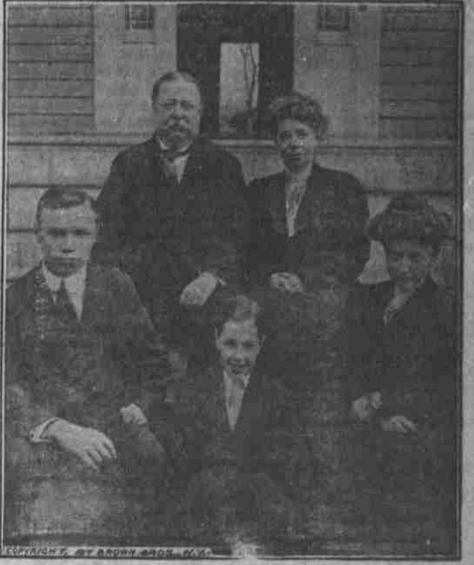
LATEST TAFT FAMILY GROUP.