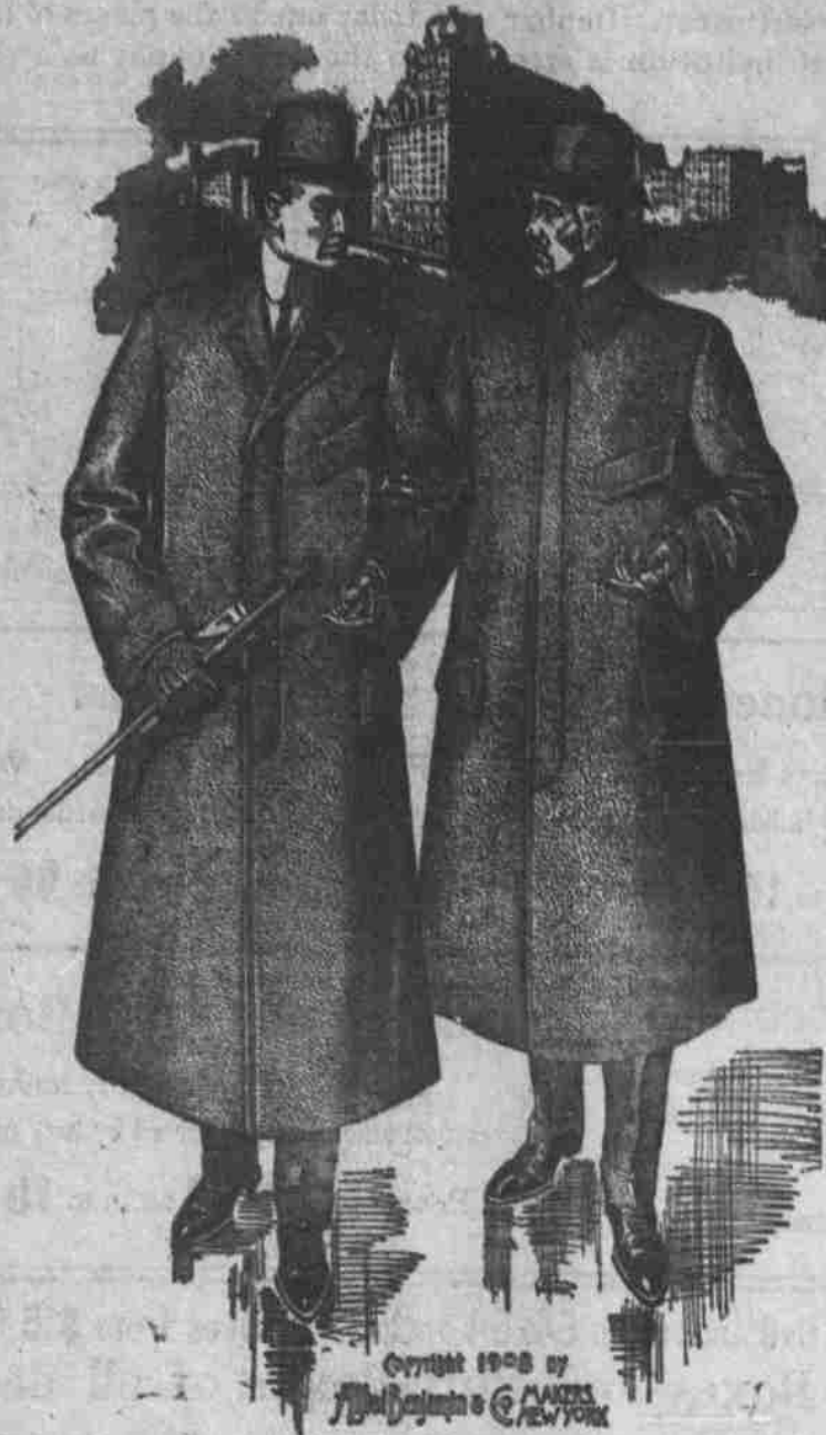
Raincoat and Utility Overcoat

So if you don't want to freeze up, you had better trot yourself down to Judd Bros and huddle into a good Benjamin Coat.