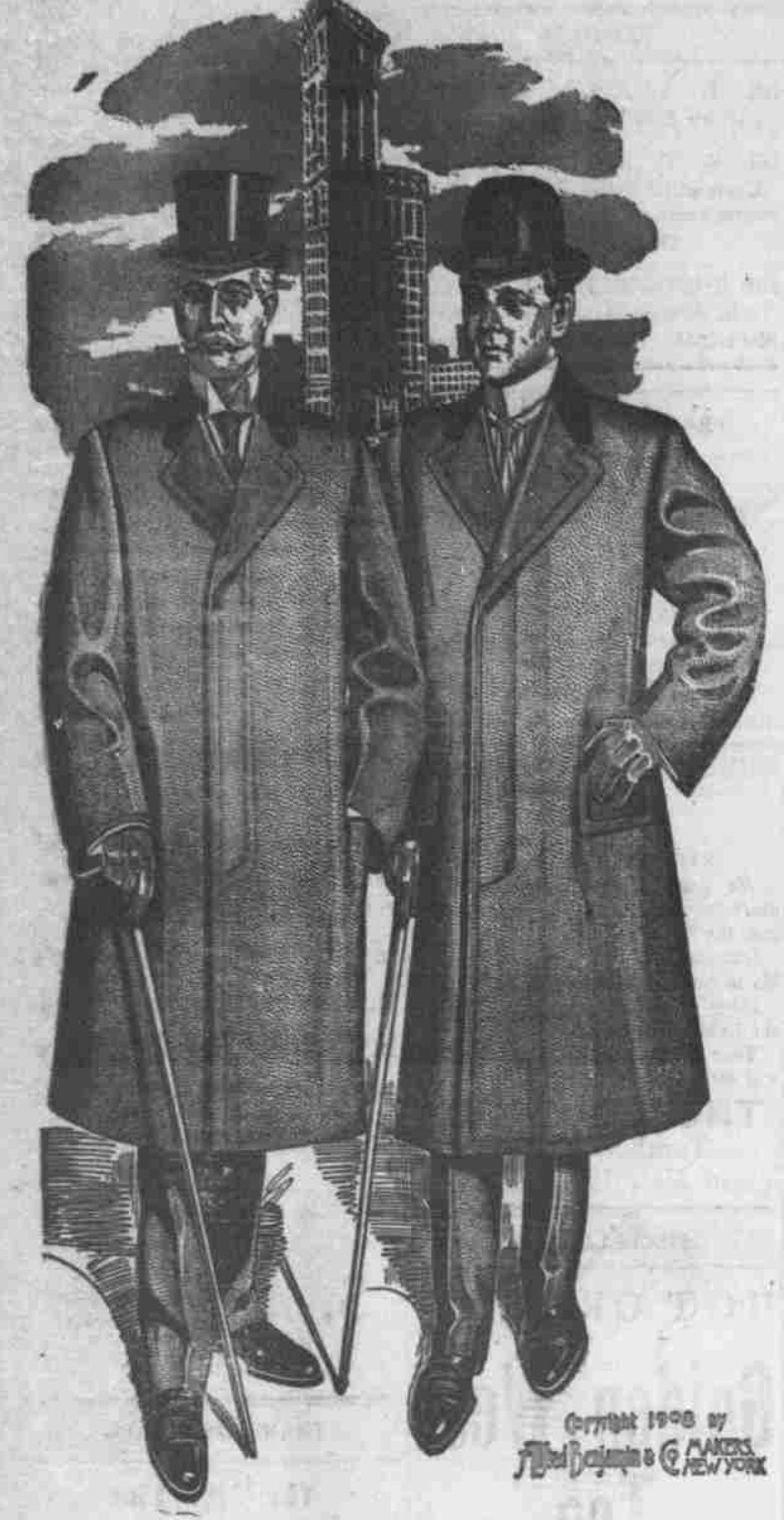
Brockbridge and "Benjamin" Overcoats