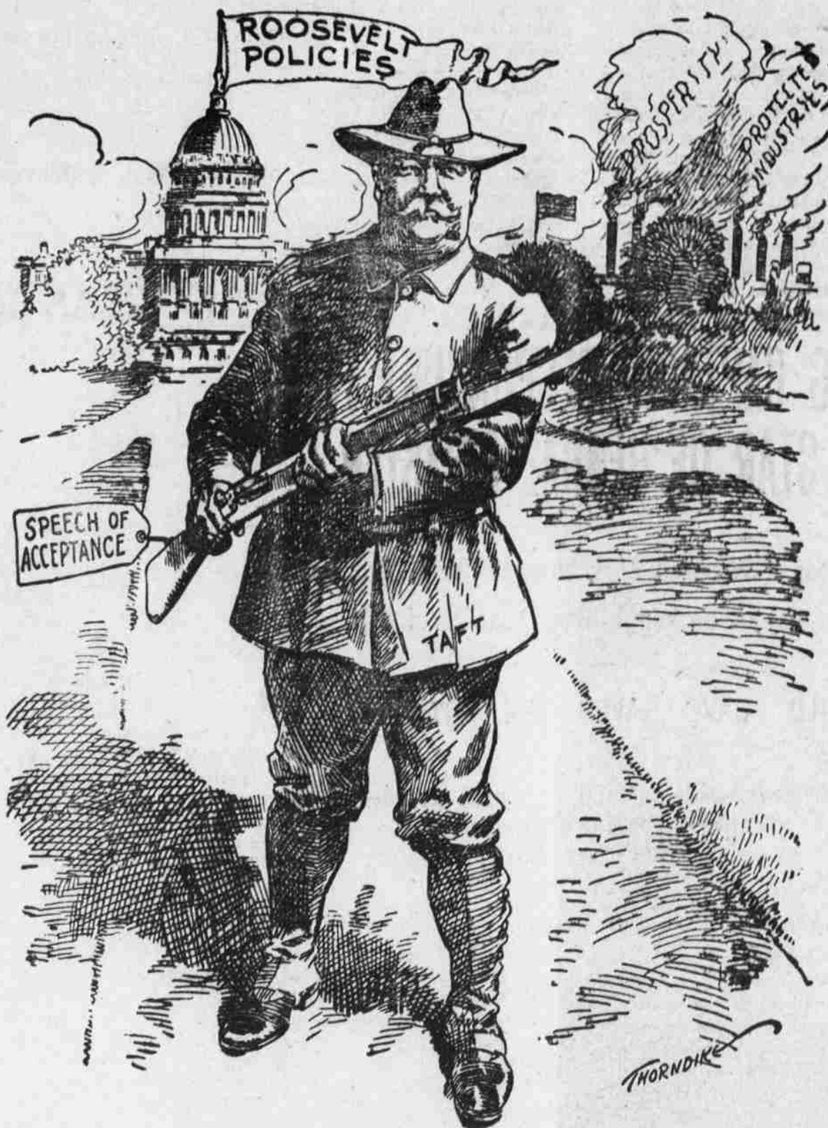
THE SENTINEL STANDS FIRMLY IN DEFENSE OF HIS FLAG.