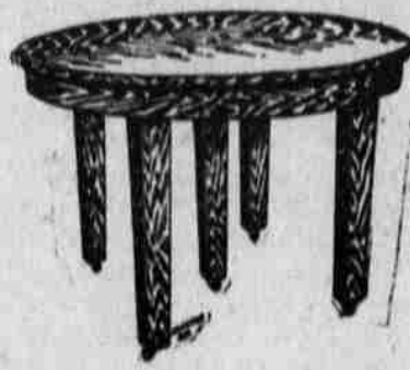
A Mission design in weathered oak finish with dinner set...$13.00

With every dining table sold we give, while they last, a 42-piece dinner set.