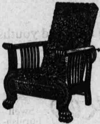
$13 is all we ask for this handsome quartered-oak morris chair.

We still have left a number of pieces of good furniture of the old stock of