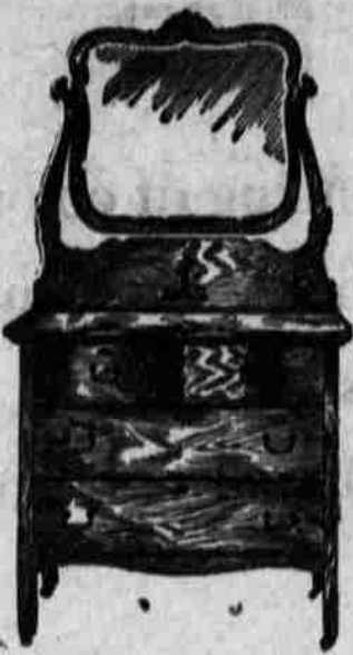
This beautiful quarter-sawn swell front dresser at $21 others from $8 up.