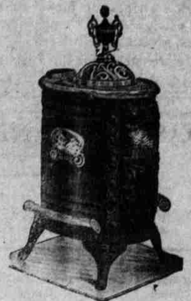
Heating stoves for one-half of regular cost.

Buy Your Furniture NOW While the Opportunity Offers