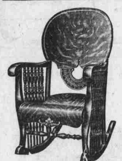
Rockers-In golden oak, mahogany and weathered oak and mission de