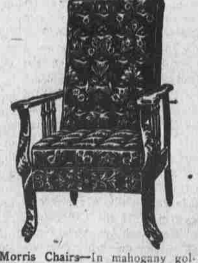
Morris Chairs-In mahogany golden oak and mission design.