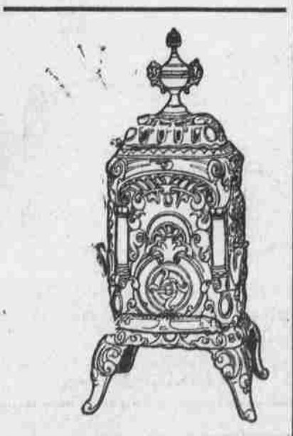
Heaters-Its near the season for heaters. A complete line air-tight coal and wood. Also a few steel ranges and cook stoves left. Come