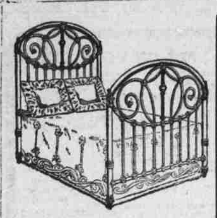
Great Bargains-Iron beds.