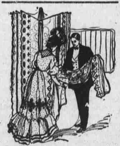
Lace Curtains, Portiers, Couch Covers and Curtain Rods.