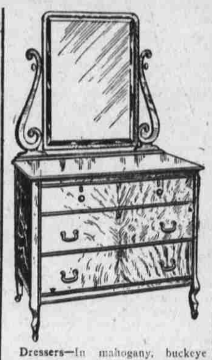
maple, golden oak.

Carpets Lineoleum Shades Bed Covers Bolster Rolls