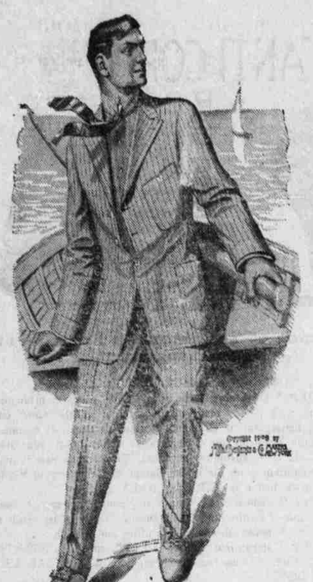
"Benjamin" Summer Outing Suit

After a most successful season we intend, by giving this great price reductions to sell out the last garment of our summer stock. A clothing sale never meant so much to Astorians before as THIS SALE, for the simple reason that this is a sale of BENJAMIN CLOTHES, America's finest clothes, and most people know that this store handles nothing but the best.