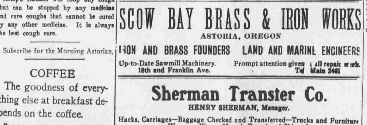
Wagons-Pianos Moved, Boxed and Shipped. Main Phone 121 433 Commercial Street.

Desk 22 ESTHETIC CHEMICAL CO., 31 West 125th St. New York: