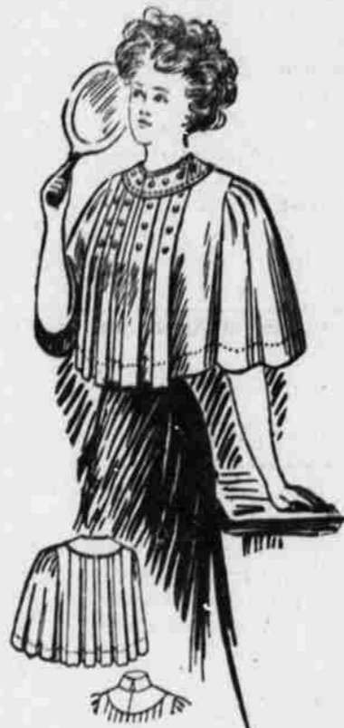
A SIMPLE DRESSING SACK—5798, step further will carry it out of sight entirely.

Long sleeves are seen again on some of the handsomest wedding gowns of the season, and not only does the bride affect them, but the bridesmaid as well.