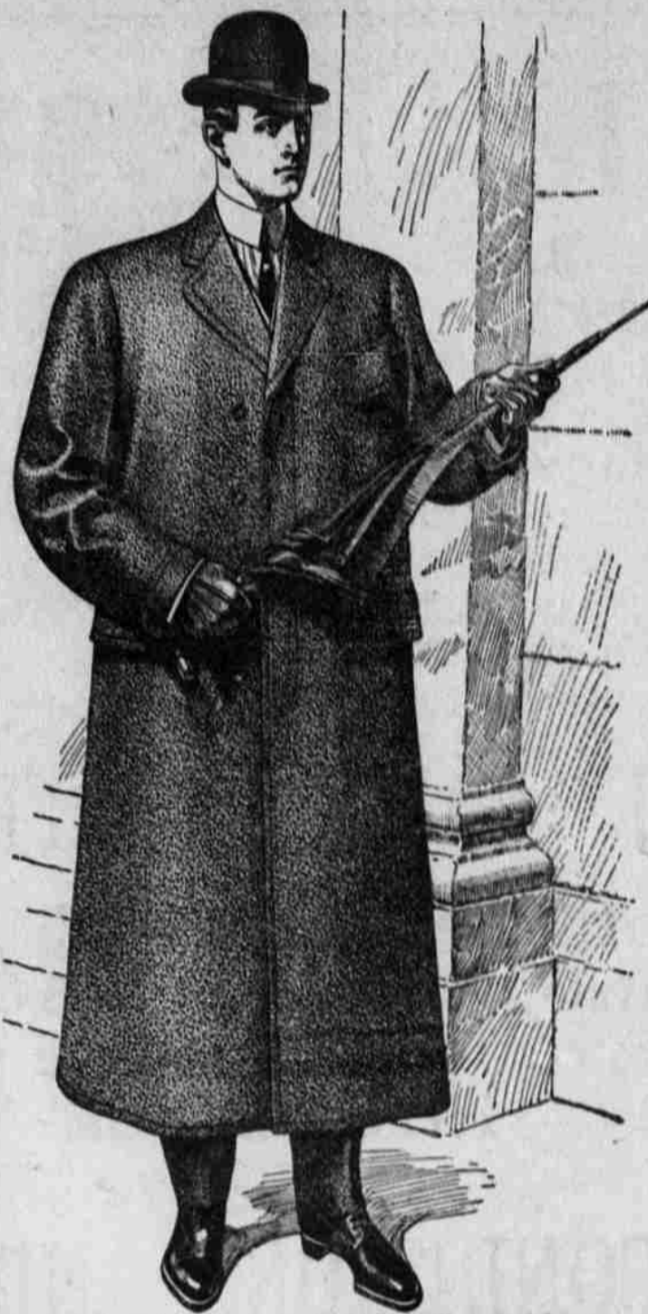
Copyright 1908 by Hart Schaffner & Marx

Your grocer returns your money if you don't like it; we pay him