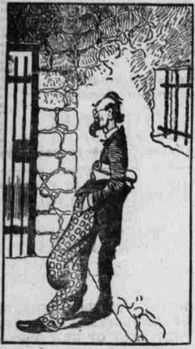
"I WAS IN JAIL FOR LICKING THE LIGHT NING ROD MAN."

No one within sound of my voice will dispute the fact that a new era