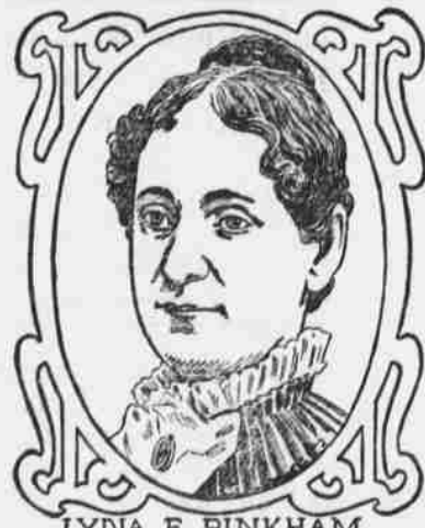
LYDIA E. PINKHAM

No other medicine has been so successful in relieving the suffering of women or received so many genuine testimonials as has Lydia E. Pinkham's Vegetable Compound. In every community you will find women who have been restored to health by Lydia E. Pinkham's Vegetable Compound. Almost every one you meet has either been benefited by it, or has friends who have. In the Pinkham Laboratory at Lynn, Mass., any woman any day may see the files containing over one million one hundred thousand letters from women seeking health, and here are the letters in which they openly state over their own signatures that they were cured by Lydia E. Pinkham's Vegetable Compound. Lydia E. Pinkham's Vegetable Compound has saved many women from surgical operations. Lydia E. Pinkham's Vegetable Compound is made from roots and herbs, without drugs, and is wholesome and harmless. The reason why Lydia E. Pinkham's Vegetable Compound is so successful is because it contains ingredients which act directly upon the feminine organism, restoring it to a healthy normal condition. Women who are suffering from those distressing ills peculiar to their sex should not lose sight of these facts or doubt the ability of Lydia E. Pinkham's Vegetable Compound