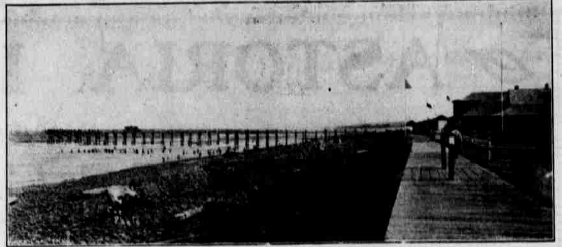
THE BOARD WALK AND PIER, SEASIDE.