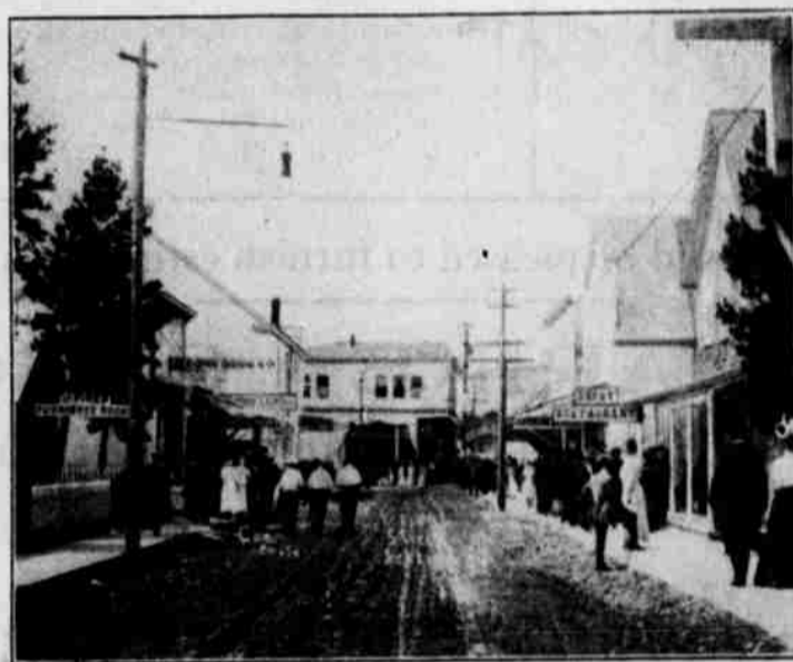
STREET SCENE, SEASIDE.

points of interest; a tired visitor has but a single step to make to secure the quietude and rest denied him in the rush of its main avenues, for the place is a delightful compound of woodland glade and sun-lit, shell-