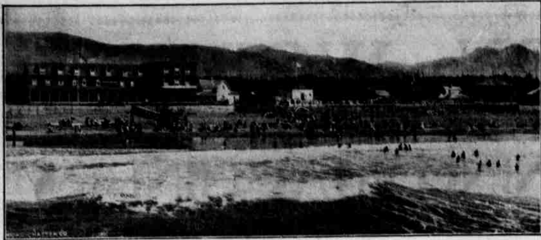
HOTEL MOORE, SEASIDE.