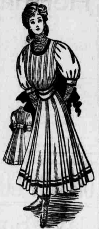
A PRINCESS DRESS. A pattern of this princess dress may be had in three sizes—for thirteen, fifteen and seventeen years. Send 10 cents to this office, giving number of pattern (248) and bust measure, and it will be promptly forwarded to you by mail.

The favorite trimming of the moment for simple hats is the ruche of